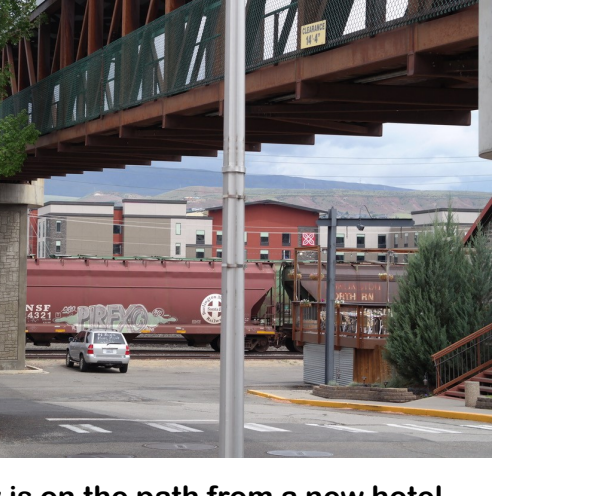
2 Rivers Gallery is on the path from a new hotel to the Convention Center.