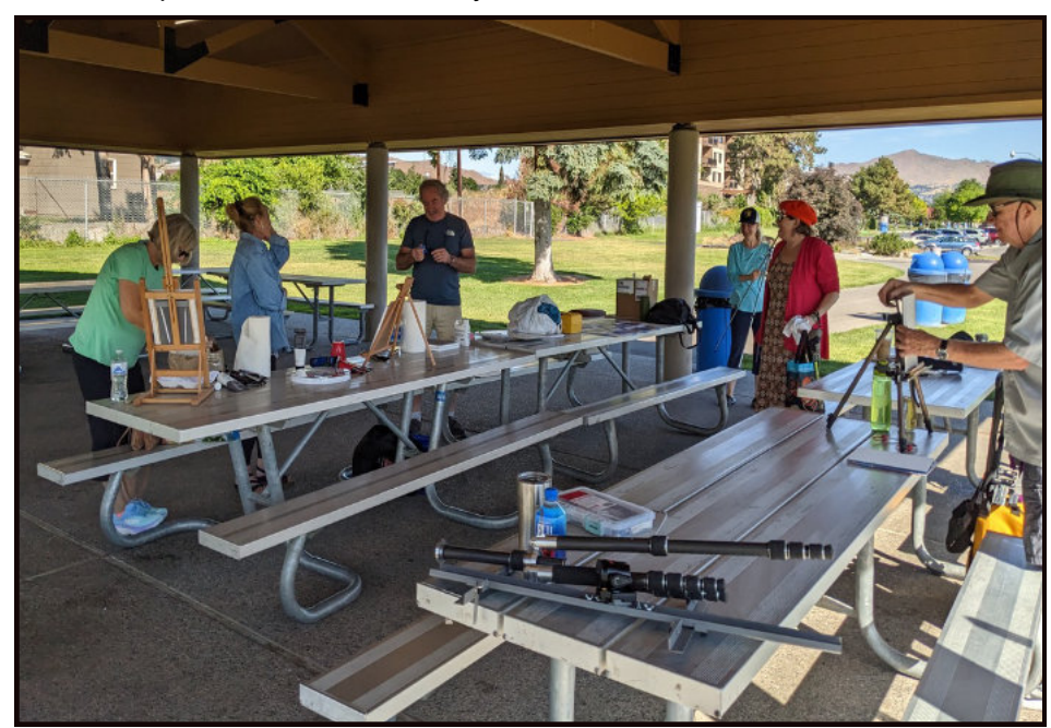
Six painters prepare to pick up skills to better their plein air paintings.

Brad got the gallery started in our first Plein Air Paint-Out in 2011 and we have sponsored one annually.