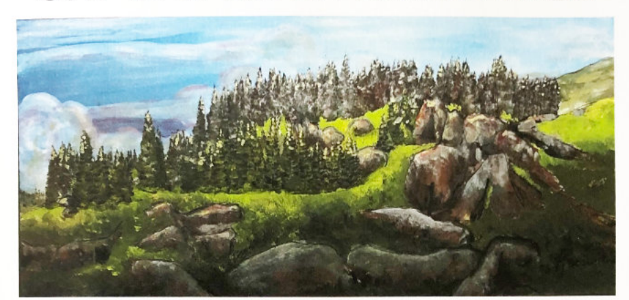
"Morning Sun Kisses Ohme Ridge"

Exhibit of Original Paintings on loan to Ohme Gardens June 9<sup>th</sup> through July 9<sup>th</sup>