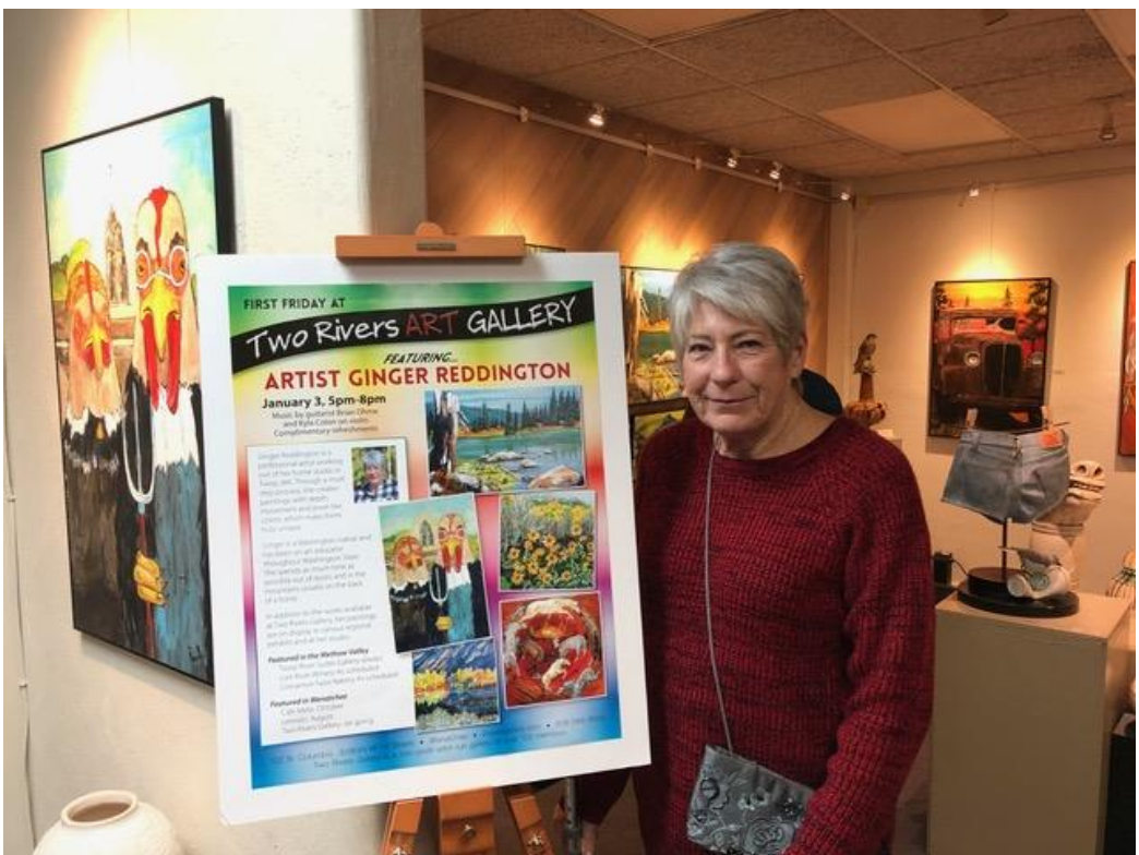
Welcome to my show.