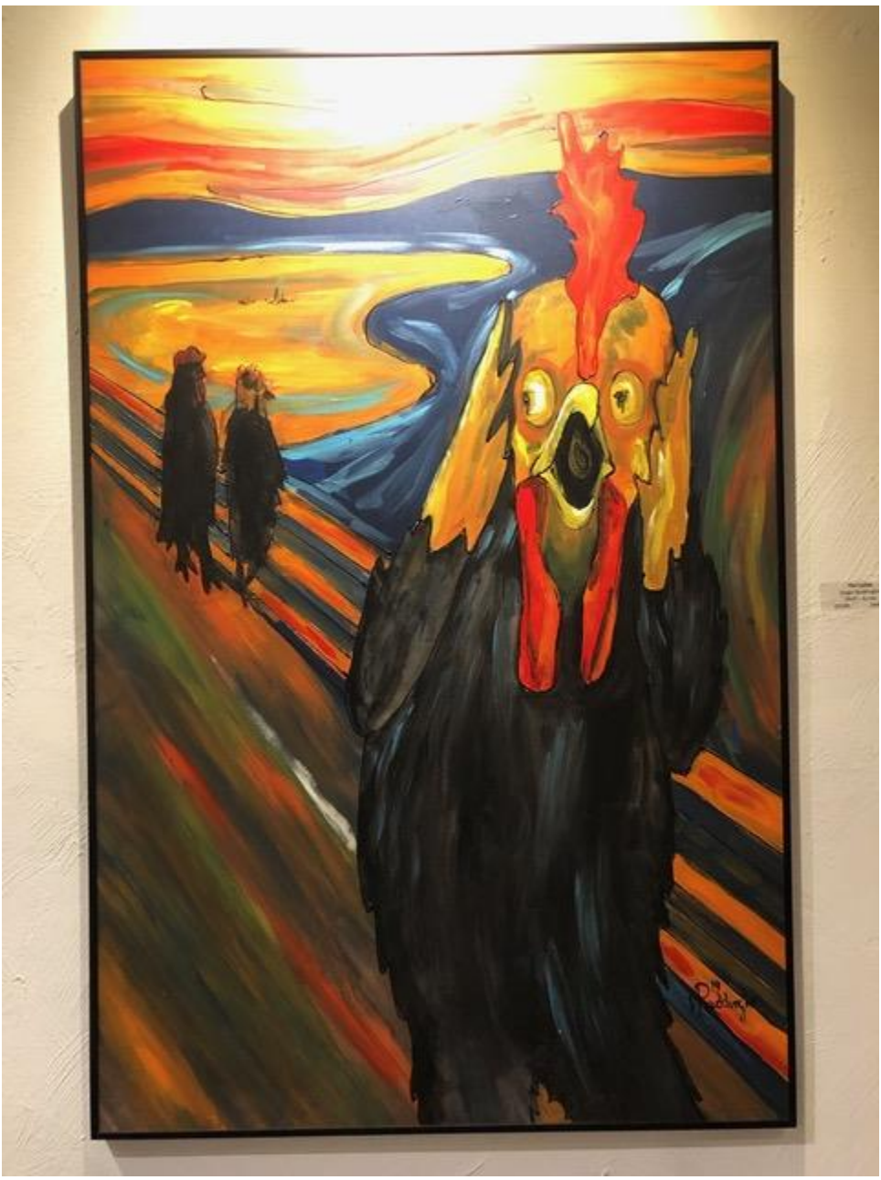
Her chicken series includes 'The Cackle'.