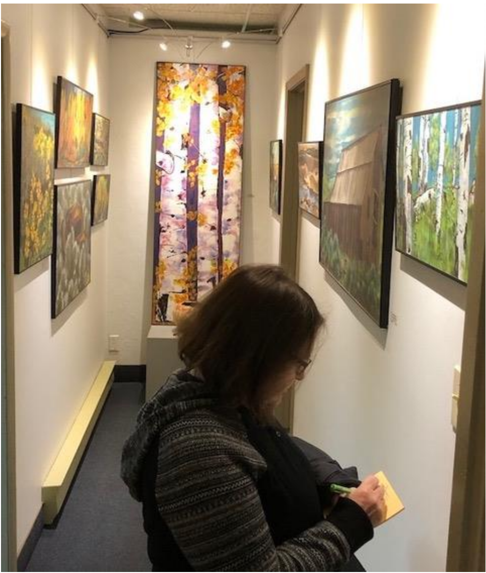
This young lady made notes about a Reddington she likes.