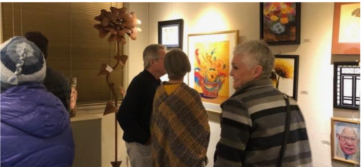
Folks were pleased by our new show...