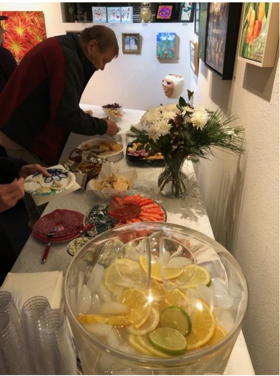
Time to refresh...