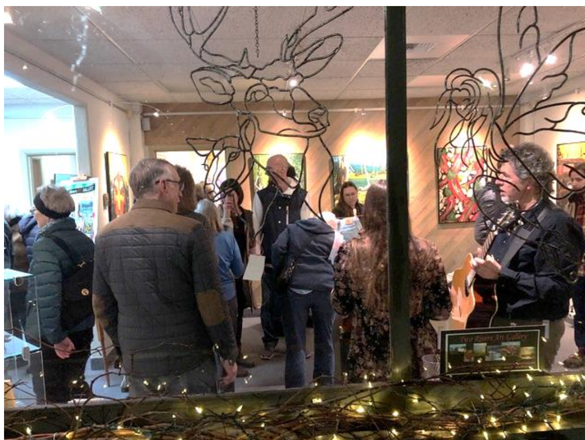
Another well attended show at Two Rivers...