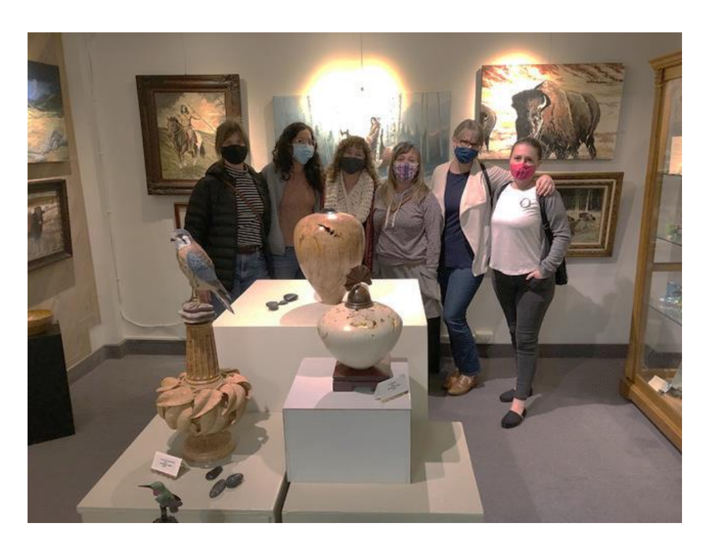
As we were closing at 8pm a group of young ladies dropped in on their way from the Collapse Gallery. Looks like it was girls' night out.