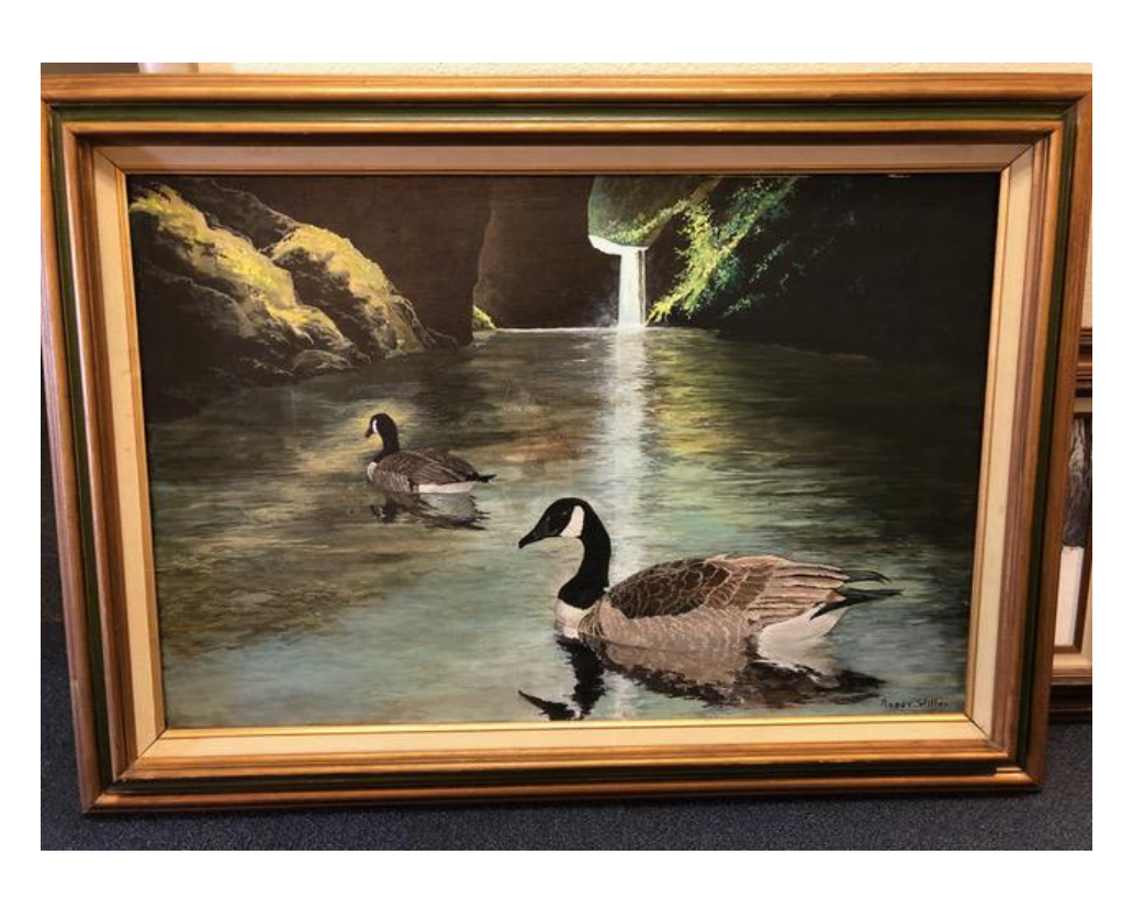
Roger Willey's show will continue through October 28.