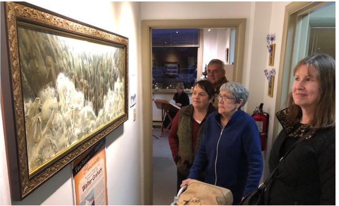
Admiring "Horsepower" the sketch approved by the PUD board in 1968. The large mural at Rocky Reach Dam is now going to be mothballed as the dam undertakes a new direction for visitors. All citizens own the PUD and many want to keep this community art treasure on public display. Voice your opinion to our PUD board.