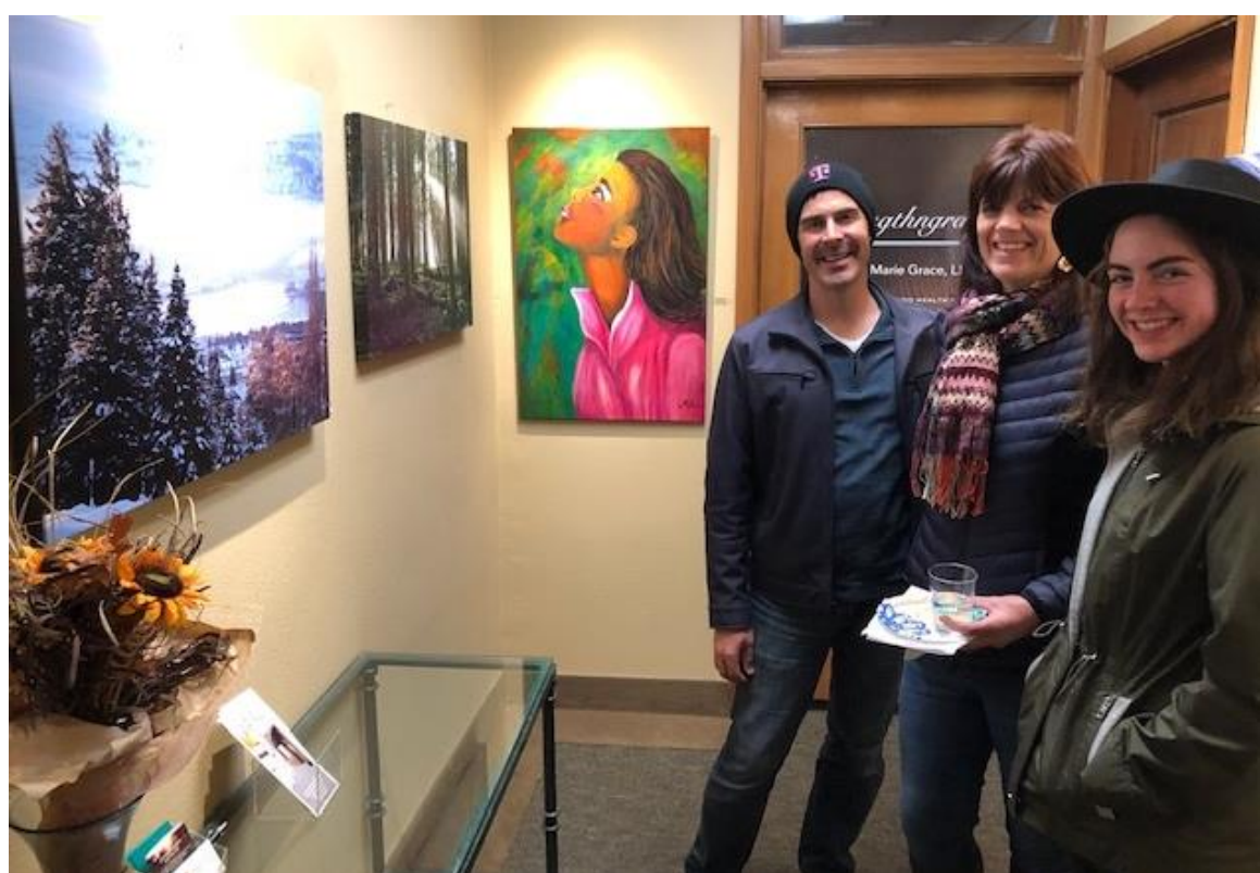
At the end of the West Wing were admirers of our new show. There were many encouraging words about the gallery and its artists.