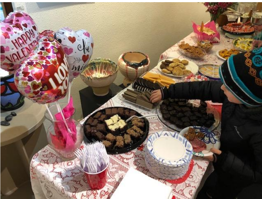
All ages love to visit the gallery.