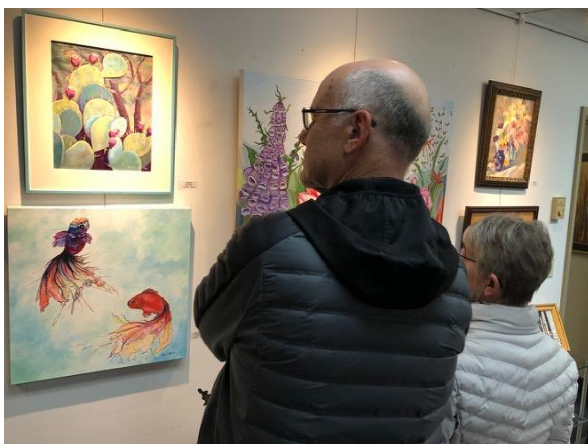
Some of our guests have not missed any of our monthly receptions.