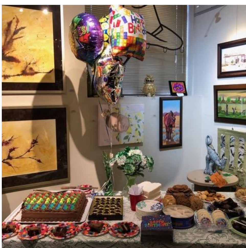
Our complimentary refreshment table is a popular place to congregate. Our birthday cake was one of many treats offered to our guests.