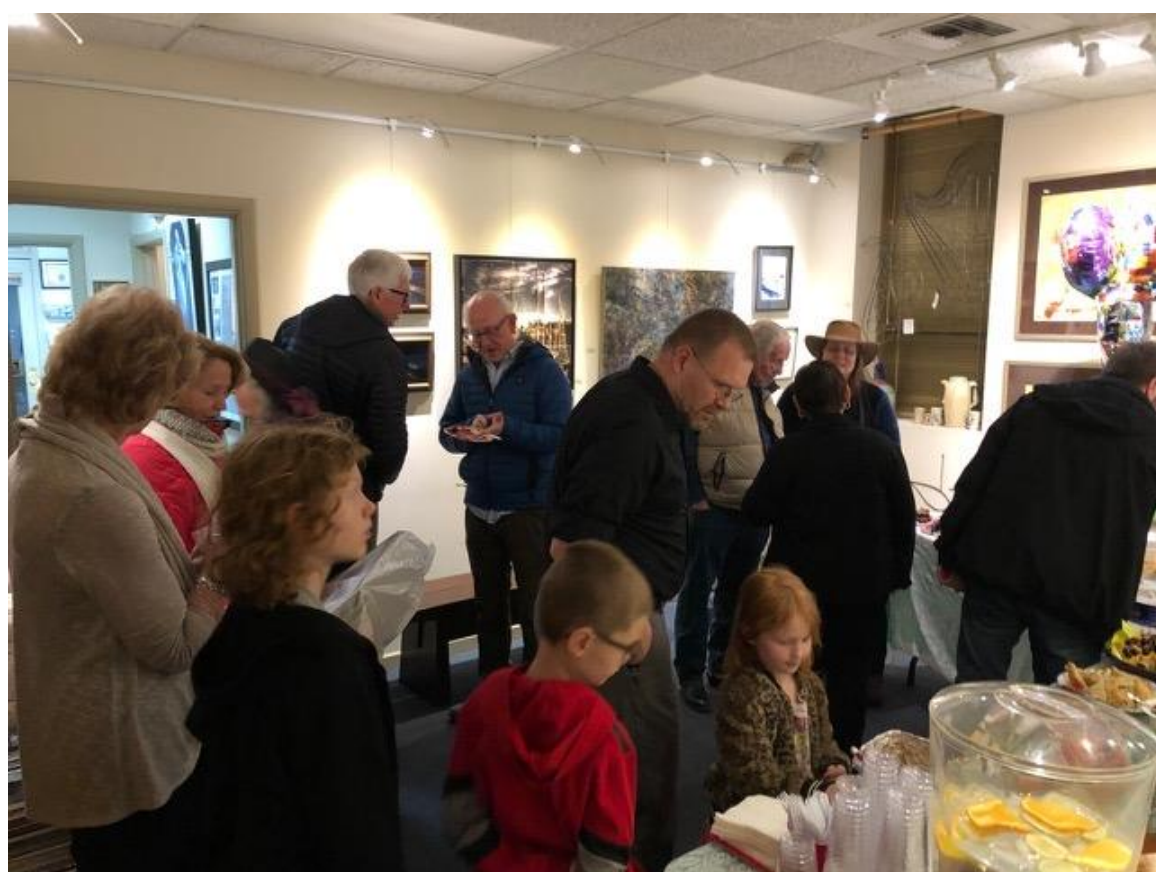
Dad brought his 3 children to have an art gallery experience. He shared with us that his mother took him to creative events. He wants to expose his children to cultural events as well.