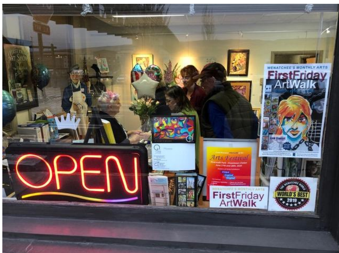
The readers of the Wenatchee World voted our gallery 'Best in the World' for several years.