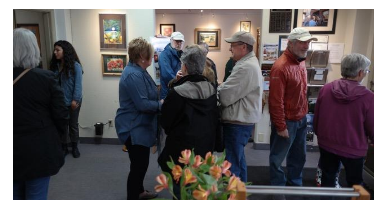
Two Rivers is 'the place' to meet artists who live here in North Central Washington.