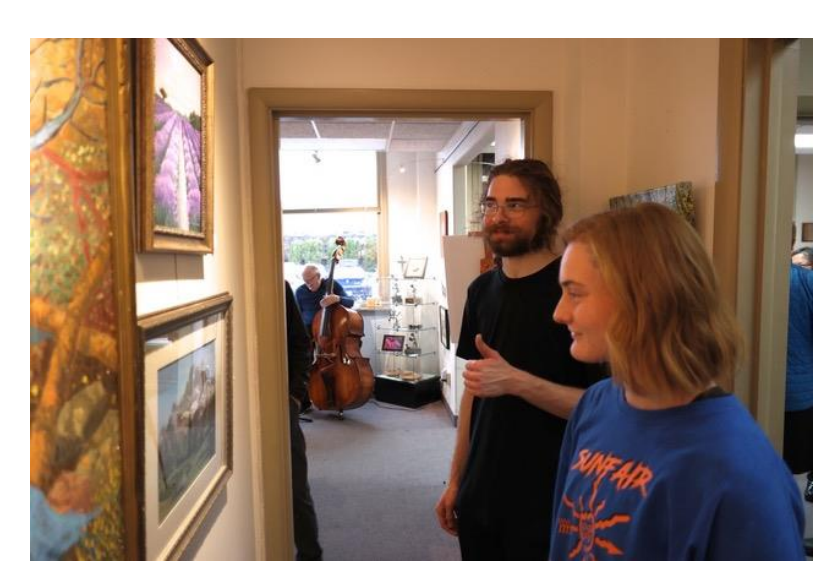
It's a thumbs up to the show.