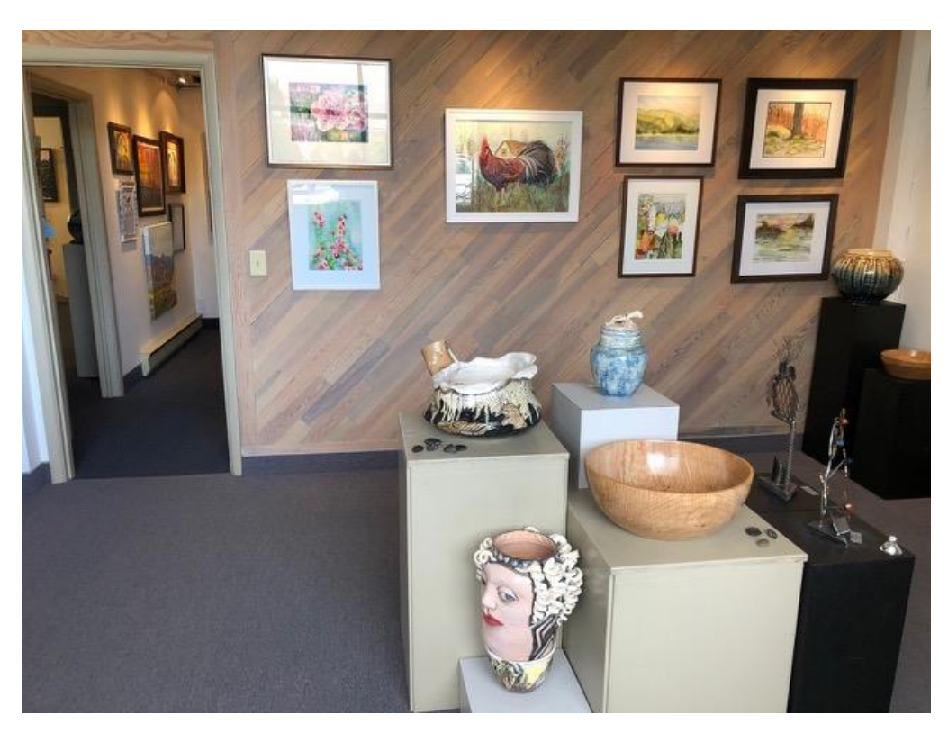
The Watercolor Society is open to all who want to develop their painting experience. They meet at 9:30am the second Thursday of each month at Ridgeline Graphics.