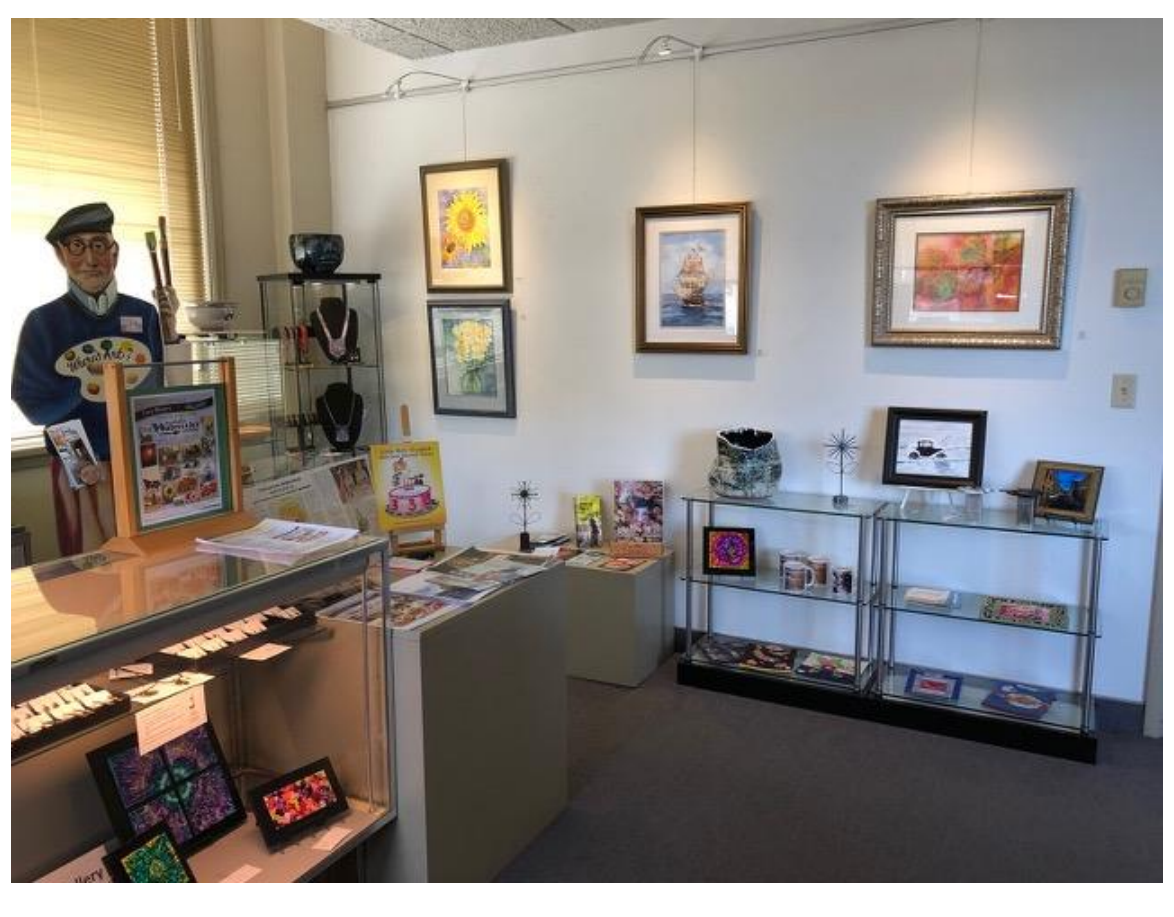
The exhibit includes a watercolor painting by each of twenty-five of its members.