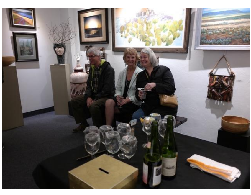
We serve bubblies, non-alcohol drinks in the 'Western Room'.