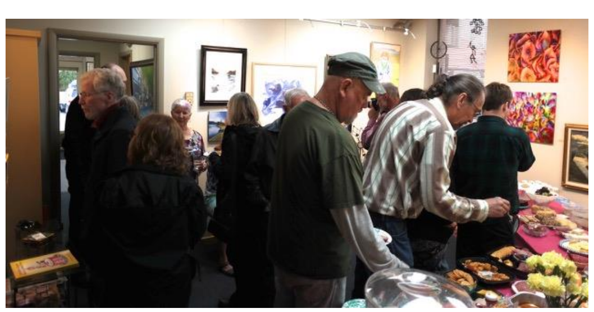
It got crowded as folks came to see the new show, visit with friends, and check out the large selection of refreshments we provide.