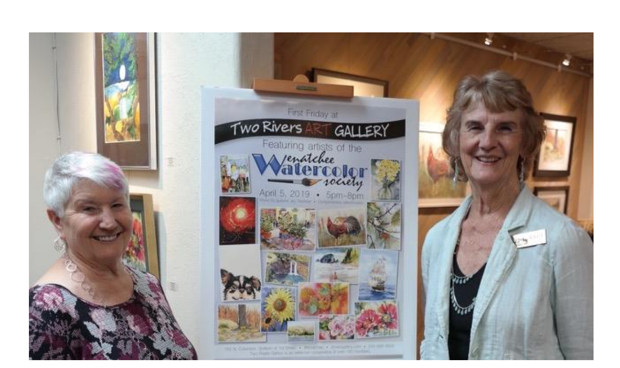
Welcome to our show