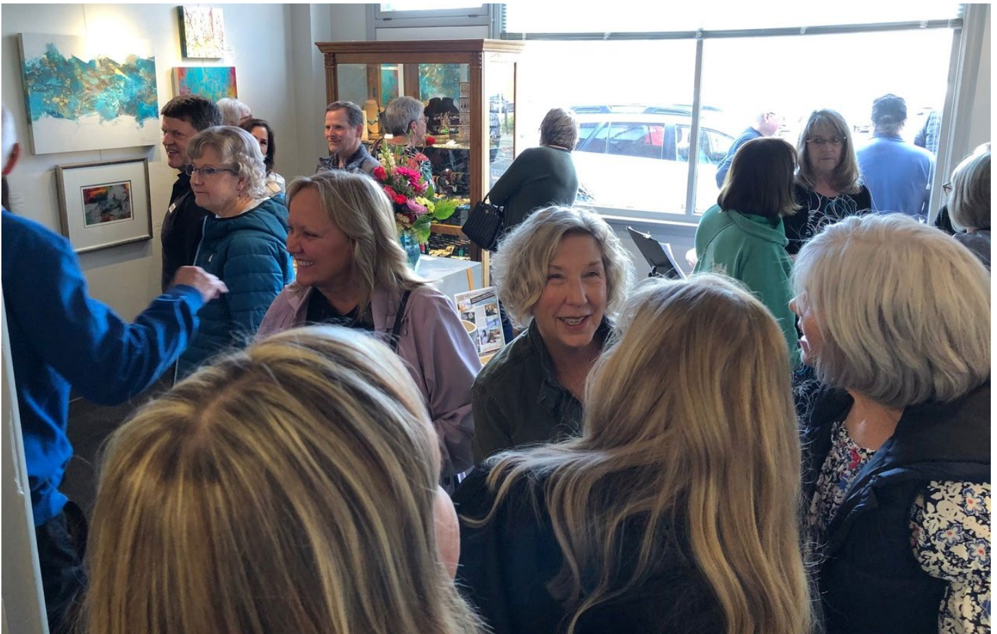
The gallery is a good place to meet friends during First Fridays.