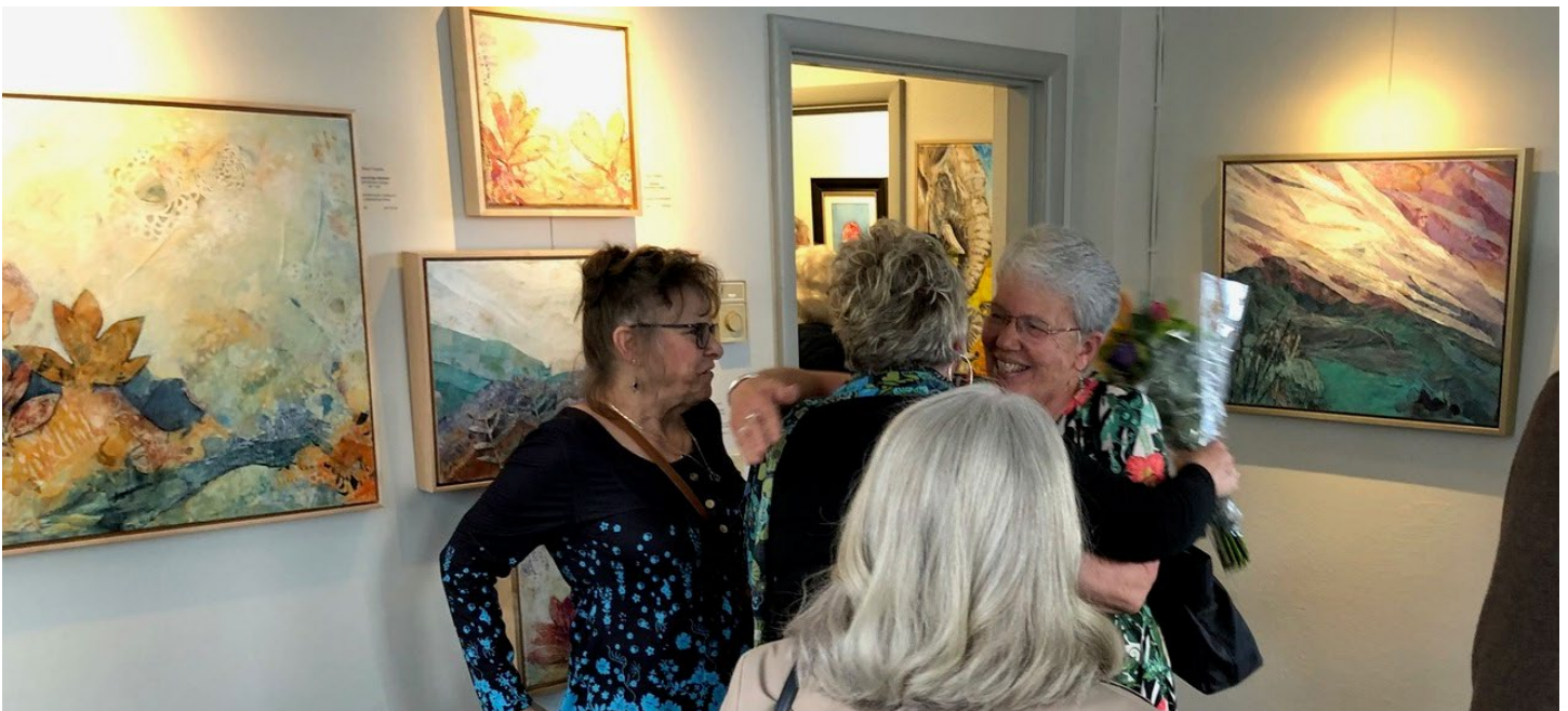
As guests enter there was lots of hugging going on!