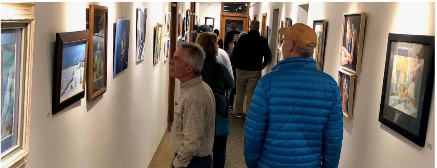
About a third of the gallery members' paintings are in the West Wing where they are admired 7 days a week.