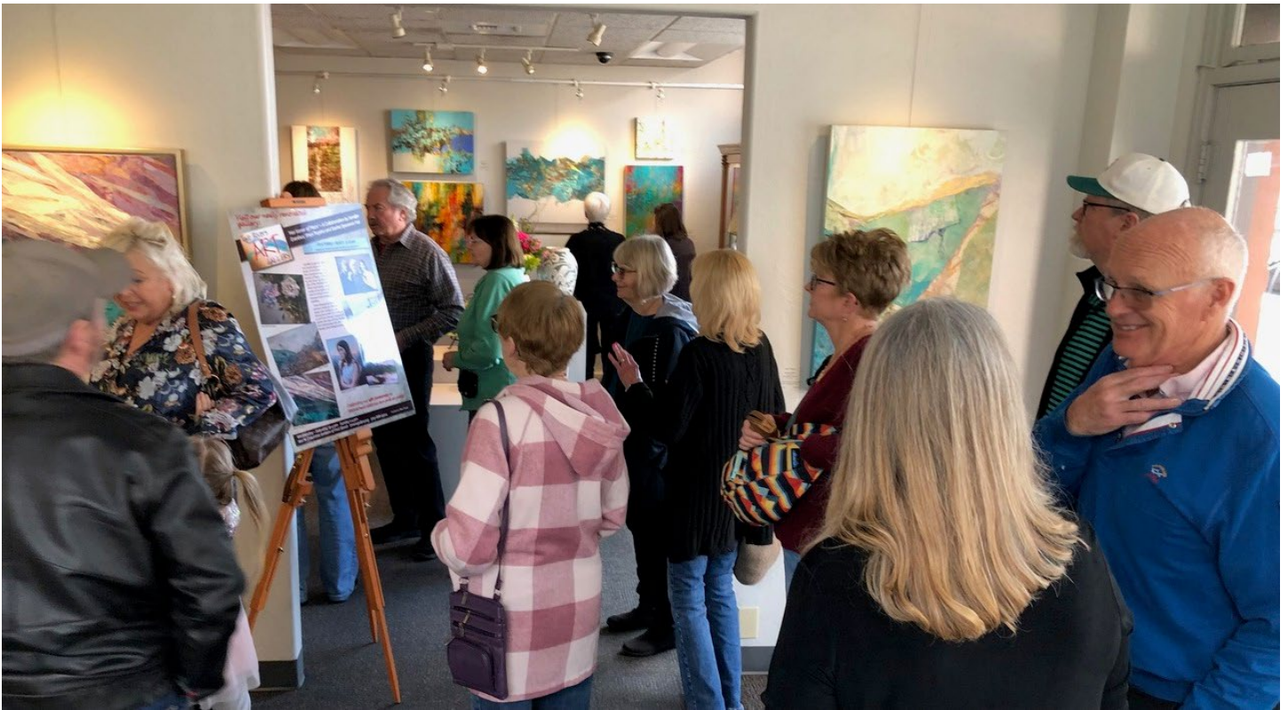
At about 5pm the crowds of art lovers came to see the show.