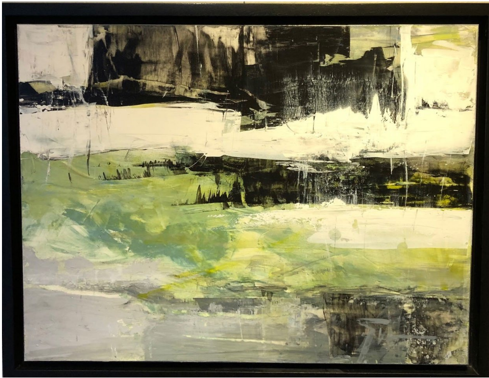
There were several admirers who chose this acrylic painting by Jen Evenhus as a favorite.