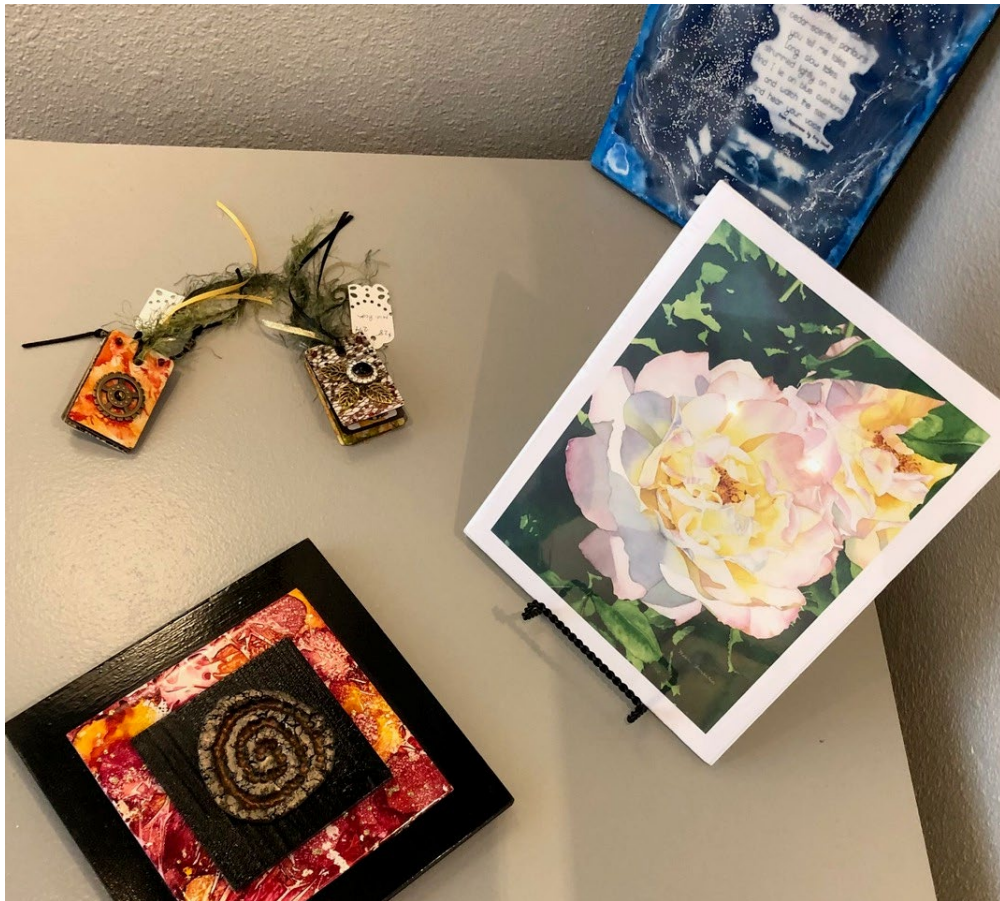
One of Eileen Thompson's mini books sold.