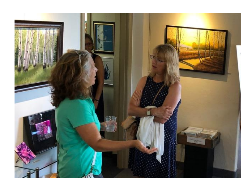
The gallery is a great place to meet up with friends each month.