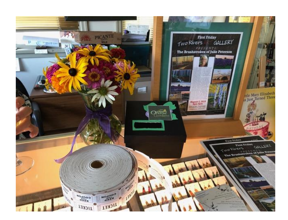
Tonight we are giving away 6 admission tickets to Ohme Gardens...