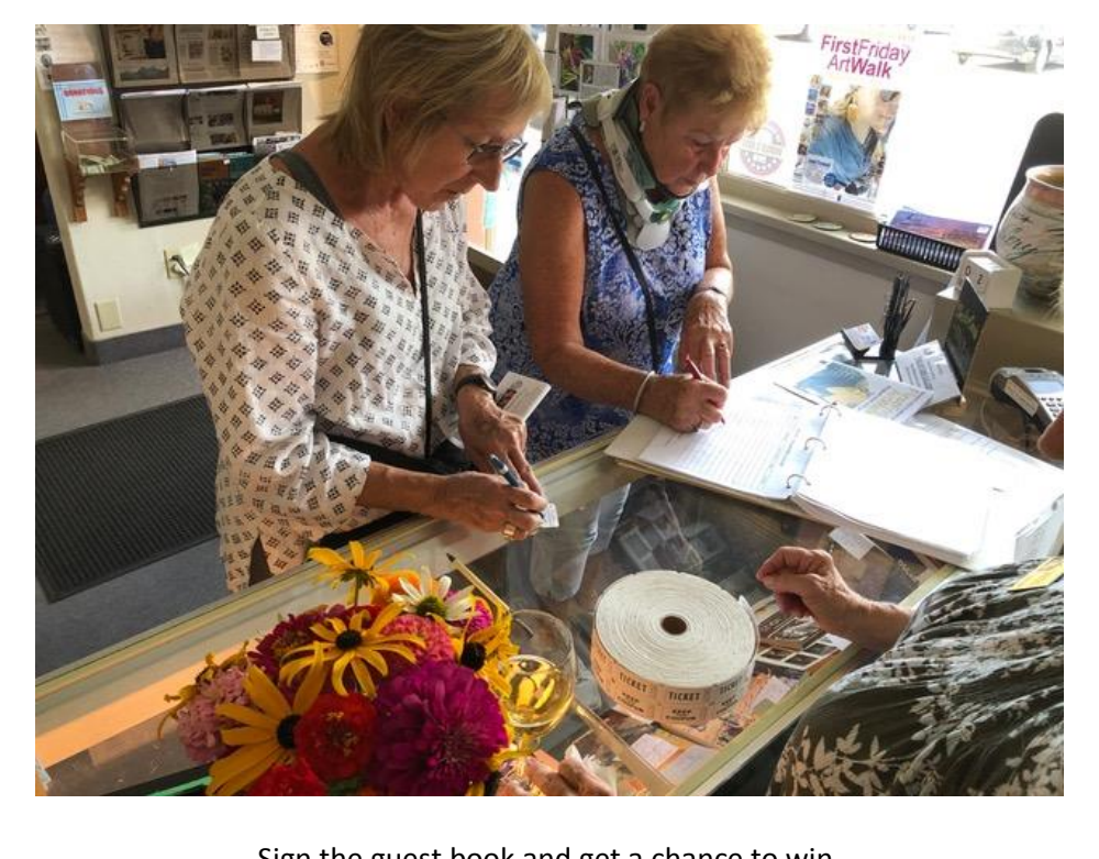
Sign the guest book and get a chance to win.