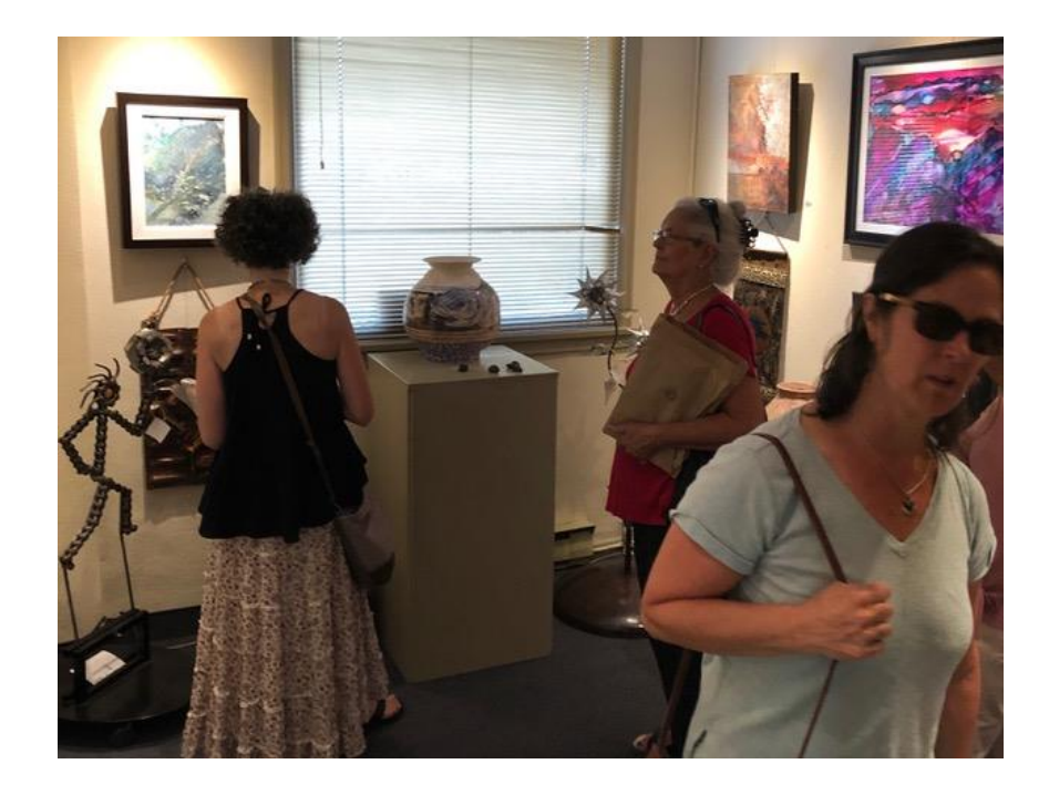
Many of our guests were from nearby hotels. These folks were from Port Orchard.