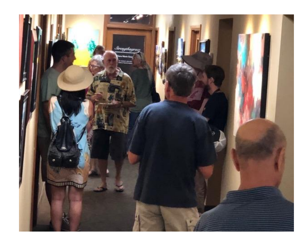
Folks thought there would be more elbow room in the West Wing. All parts of the gallery were crowded at times.