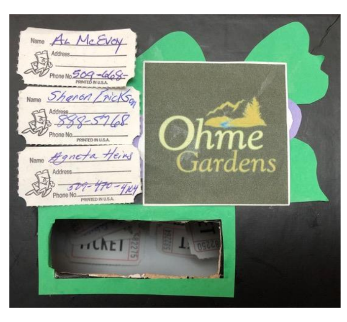
And the winners are...