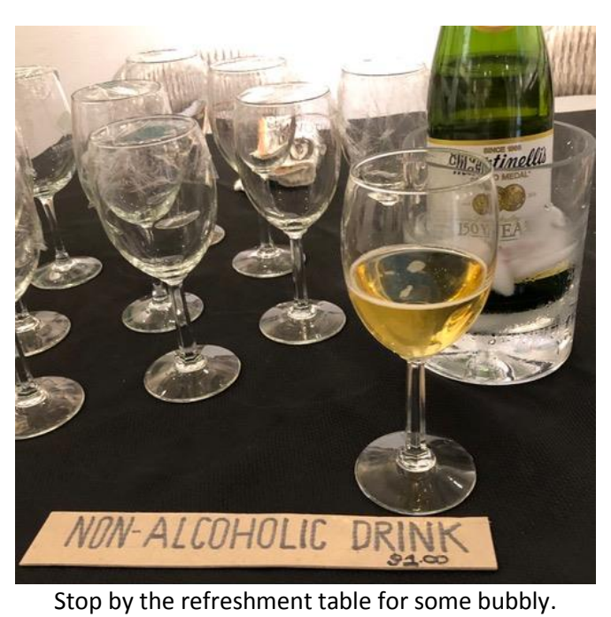
Stop by the refreshinent table for some bubbly