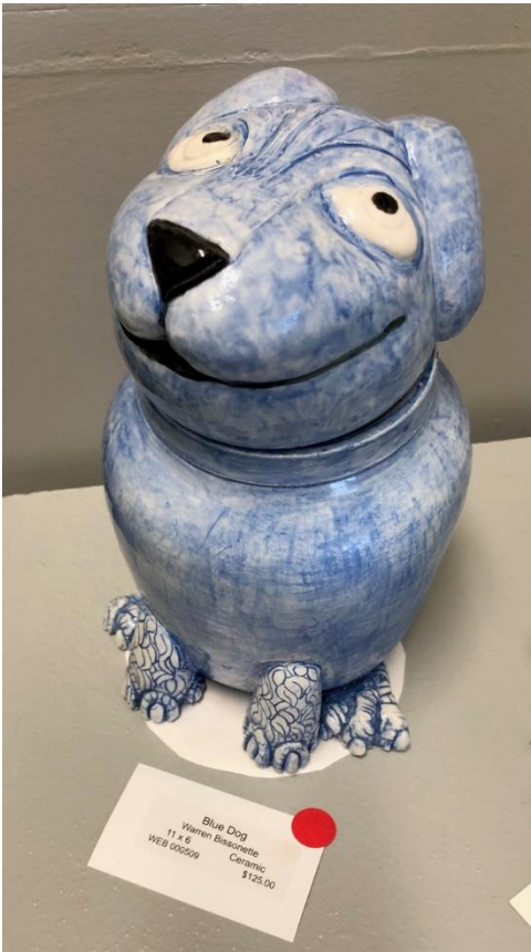
SOLD! Warren Bissonette's "Blue Dog", admired by many, was sold to an art collector.