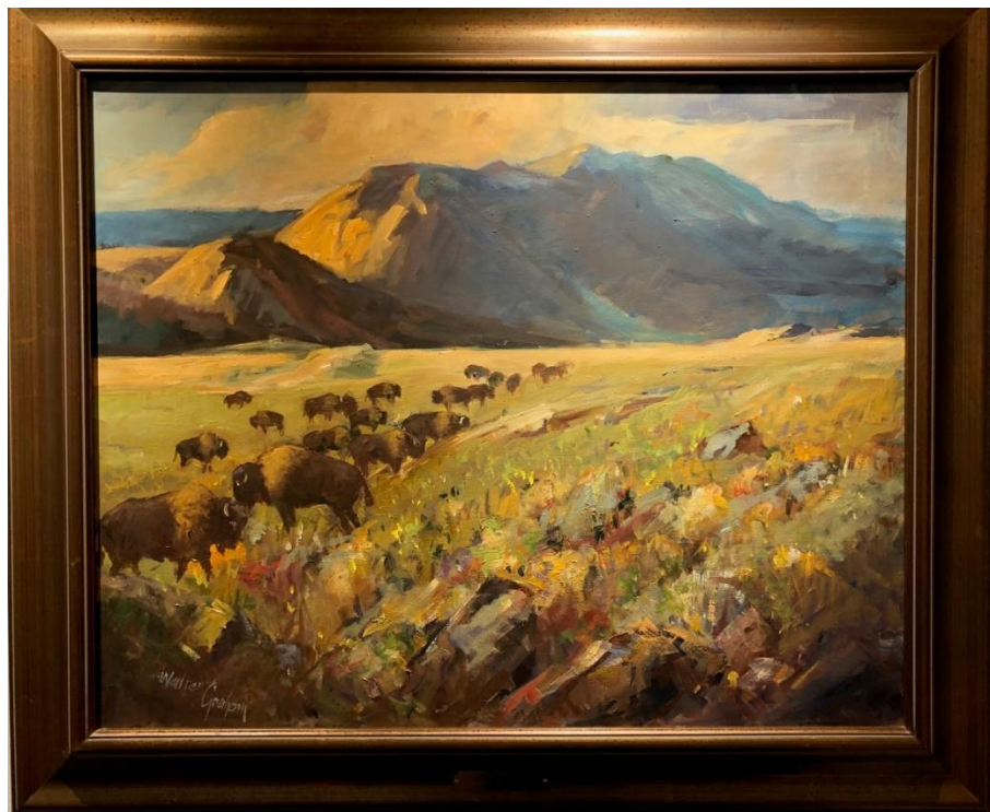
In the Western Room you will see western paintings by Walter Graham...