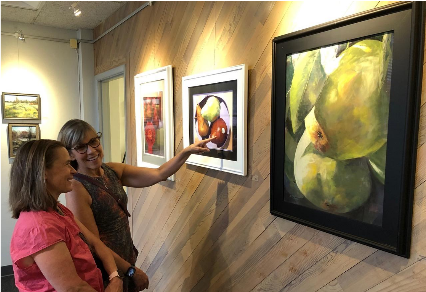
Two visitors from North Bend enjoying our First Friday show.