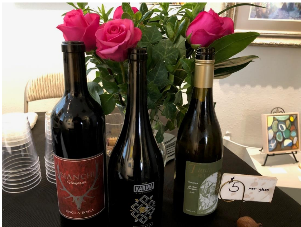
Local wines were served.