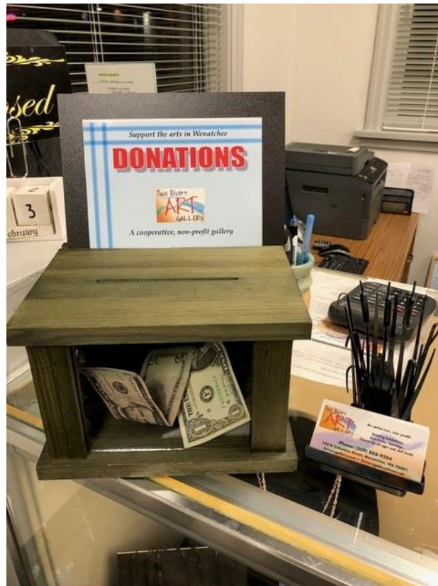
The gallery renovation became possible from the many donations and Grants received. We thank the generous contributors of our community and all who make our gallery Wenatchee's Artist-Run non-profit art gallery.