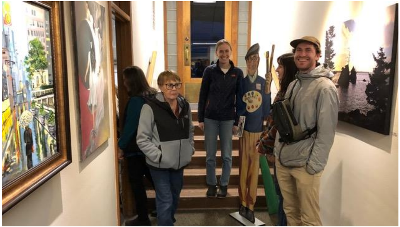
Gallery Visitors enjoyed conversing with “ART” in the newly painted West Wing.