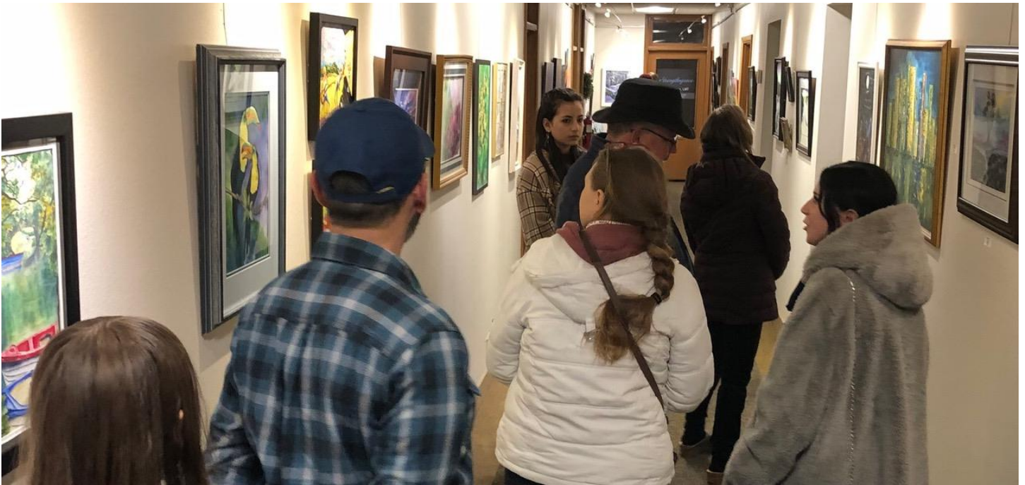
A large number of visitors attended tonight's gallery opening. The evening temperature was more like autumn, and it felt like everyone was celebrating the New Year.