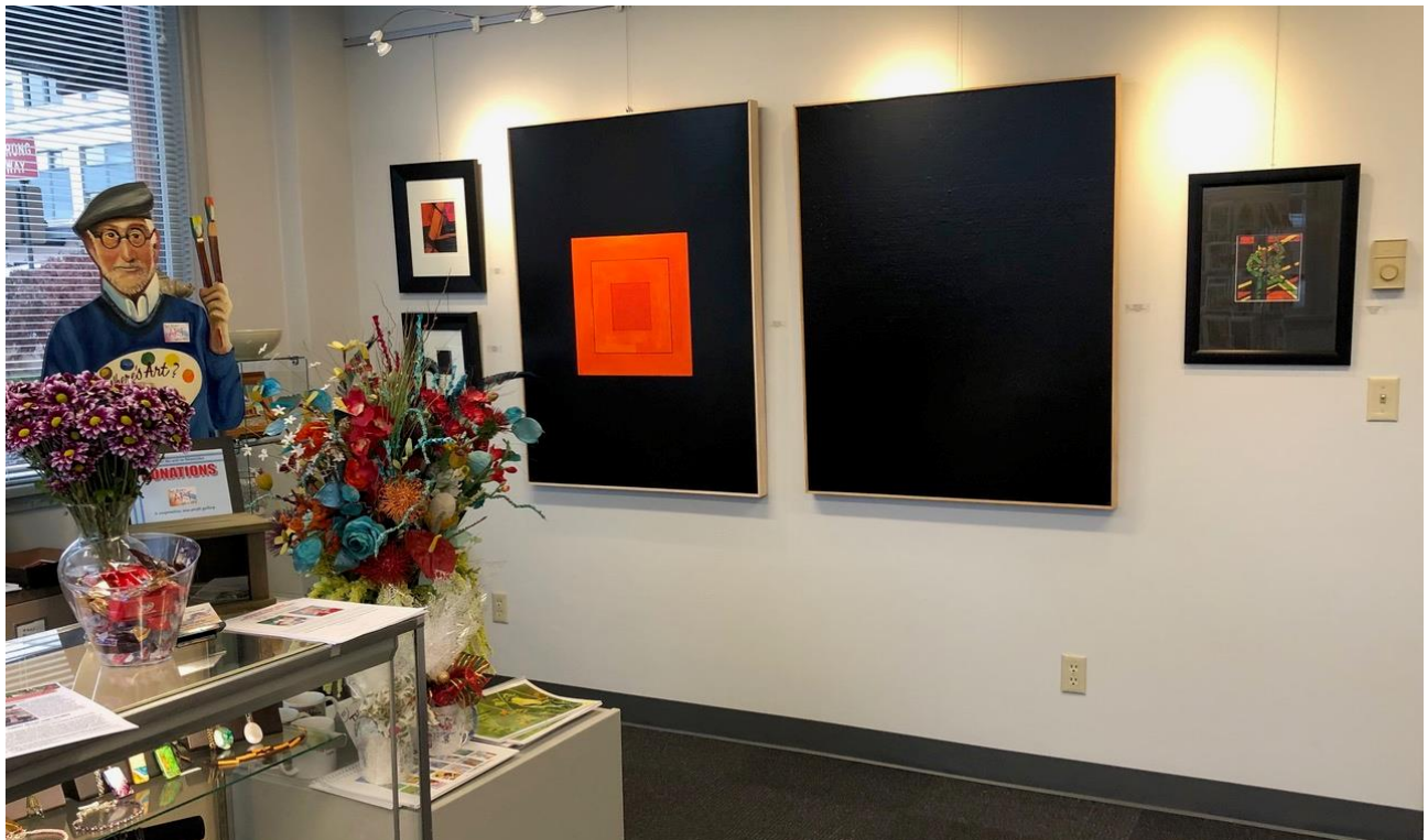
Russ Hepler's show will continue until January 28.