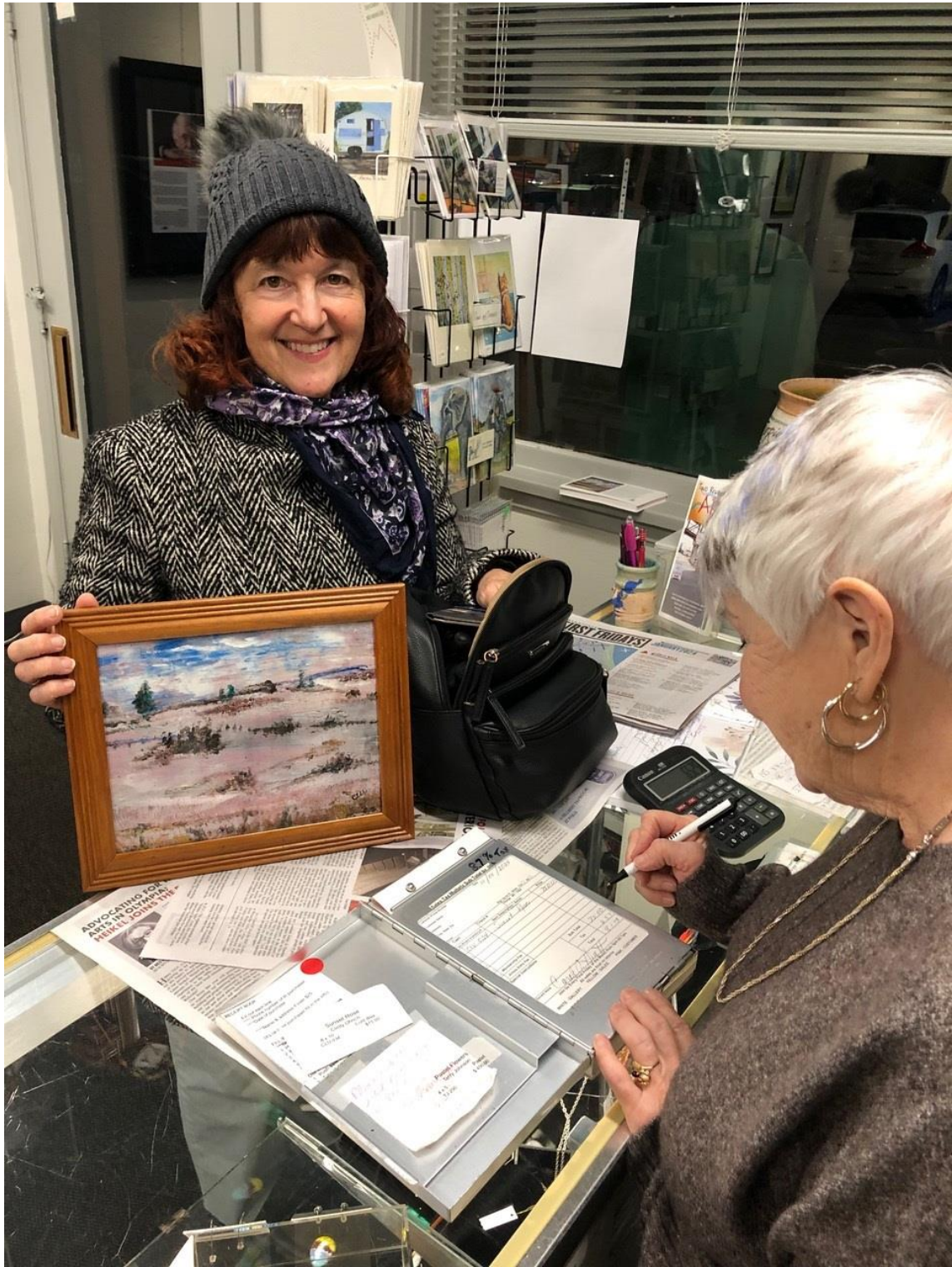
SOLD!. A painting by Cindy Uhrich was purchased by Maureen Stivers of Wenatchee. She recognizes the landscape as having unusual color in the spring and fall.