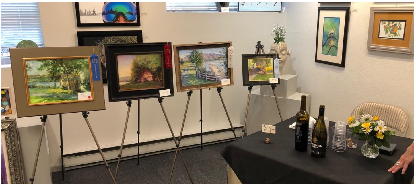
Local wineries provide the wine we serve at our First Friday events. The gallery is a good place to be introduced to some of the Valley's finest wines.