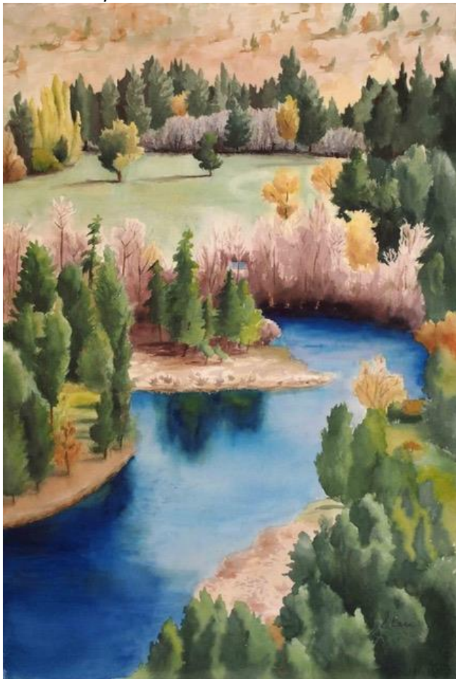
Above the Icicle