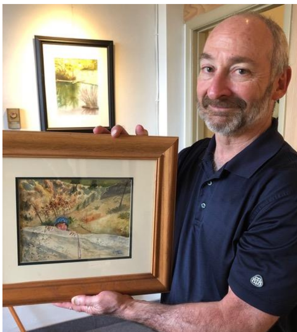
Here I am