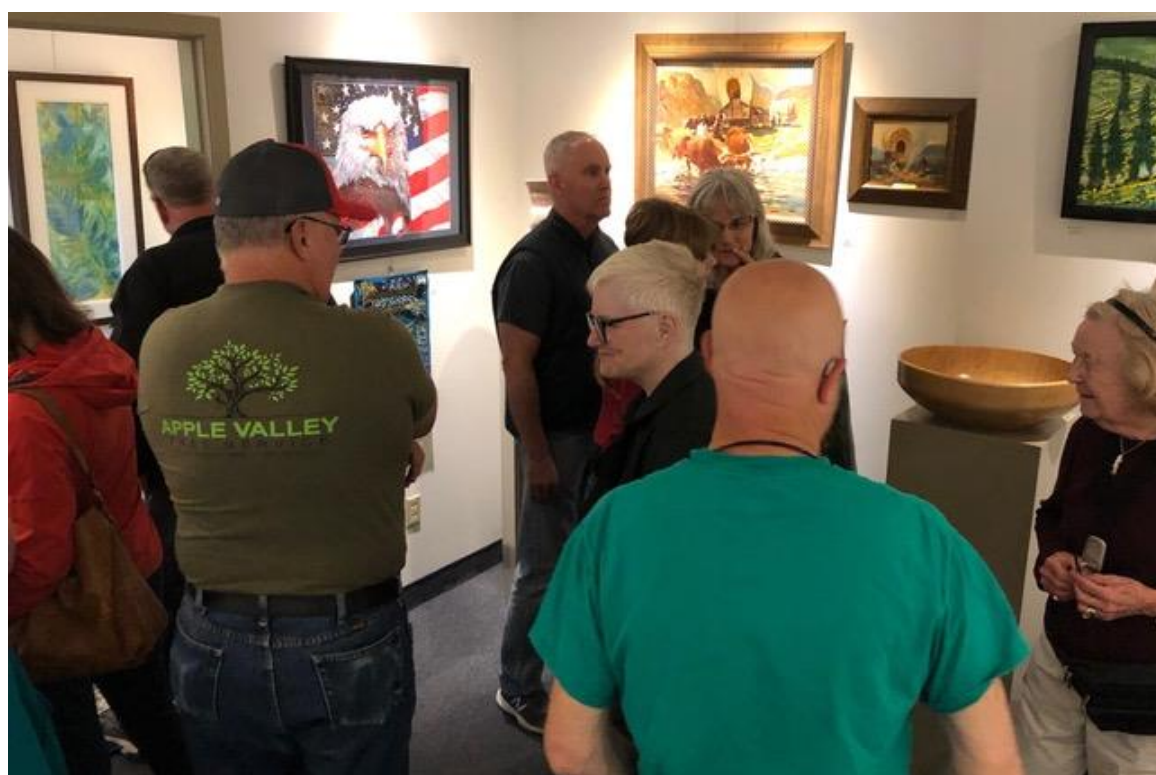
Large crowds filled the gallery at times including a bus load of art lovers from Bonaventure in East Wenatchee. The evening was also filled with graduation ceremonies from both high schools.