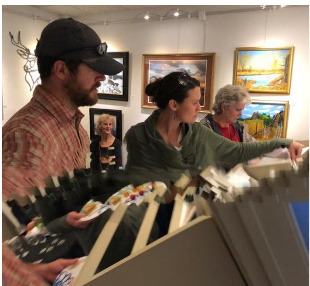
The print bin in the Western Room was a popular spot.