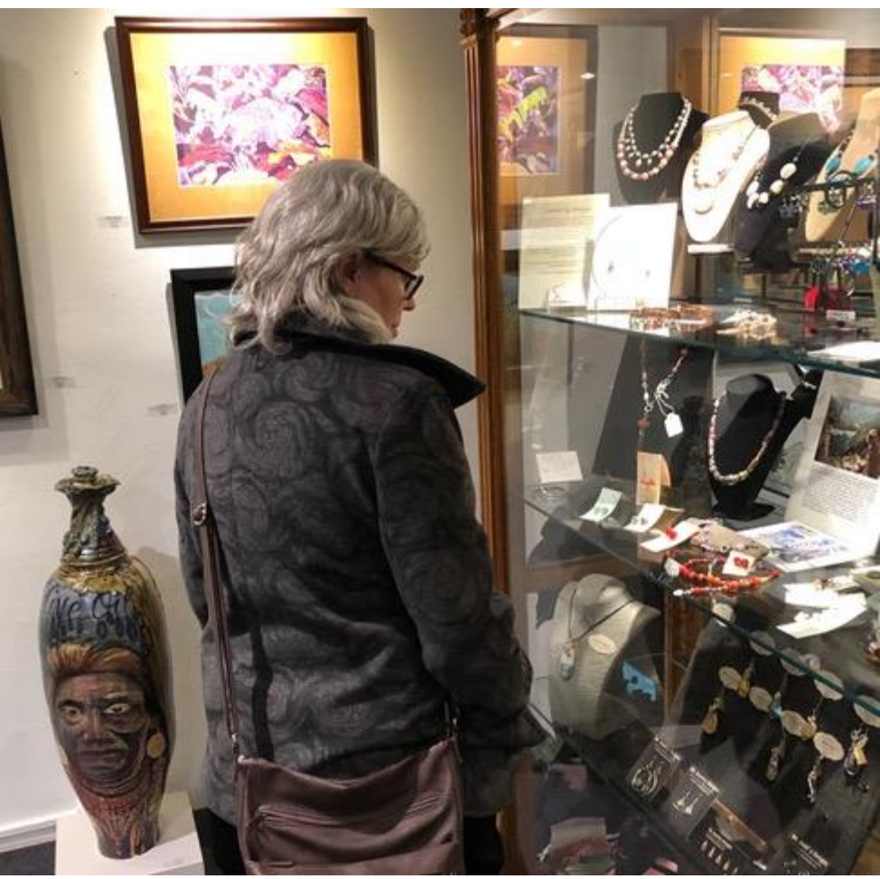
Inspecting the jewelry...