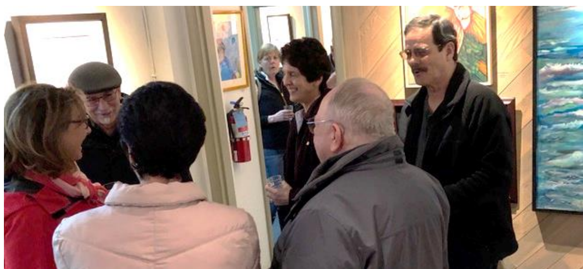
Enjoying the moment...