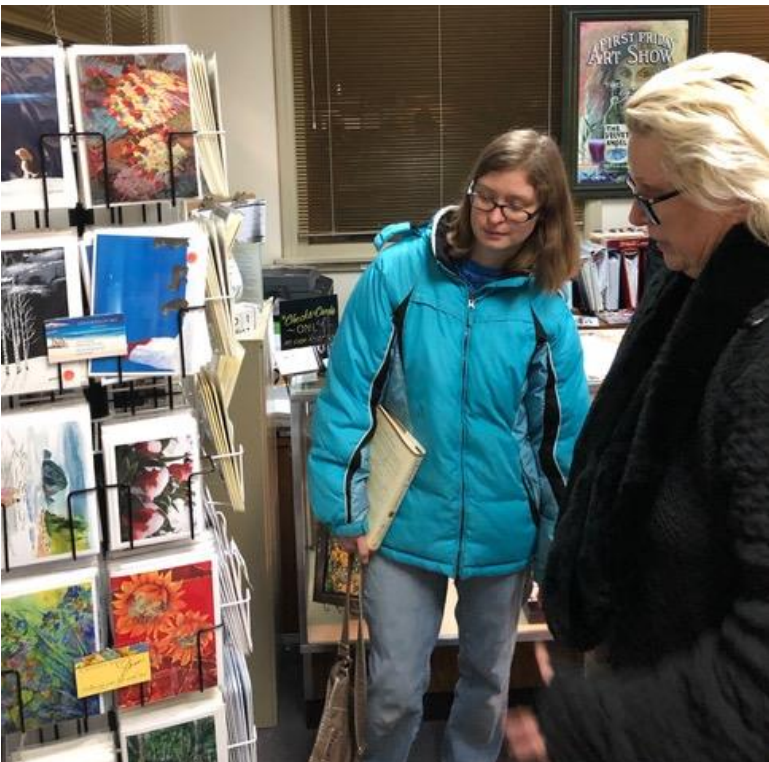
Looking over the artist cards designed by gallery members...