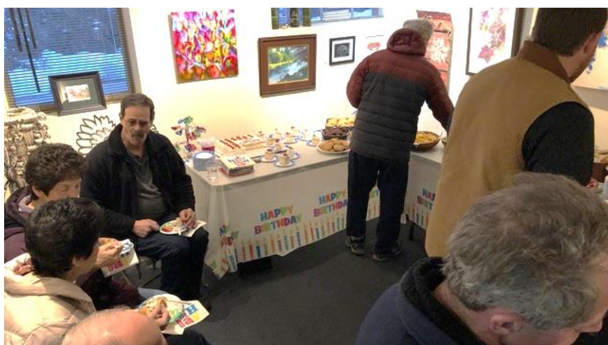
Meeting friends each month over refreshments