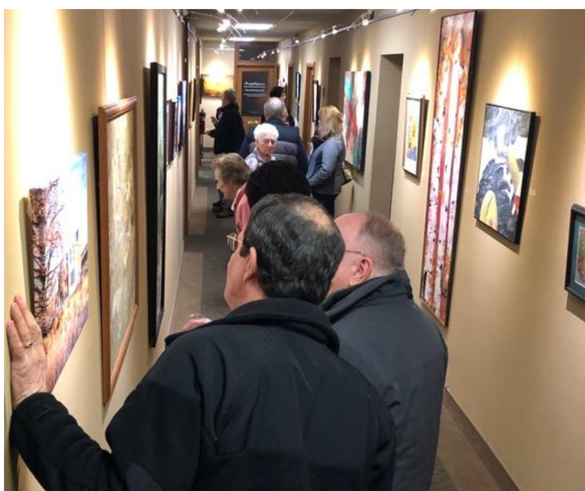
The gallery's new show had one of the largest attended opening nights in 10 years.