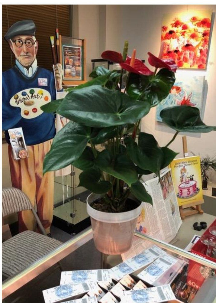
"Wenatchee Wild" game tickets were given away.