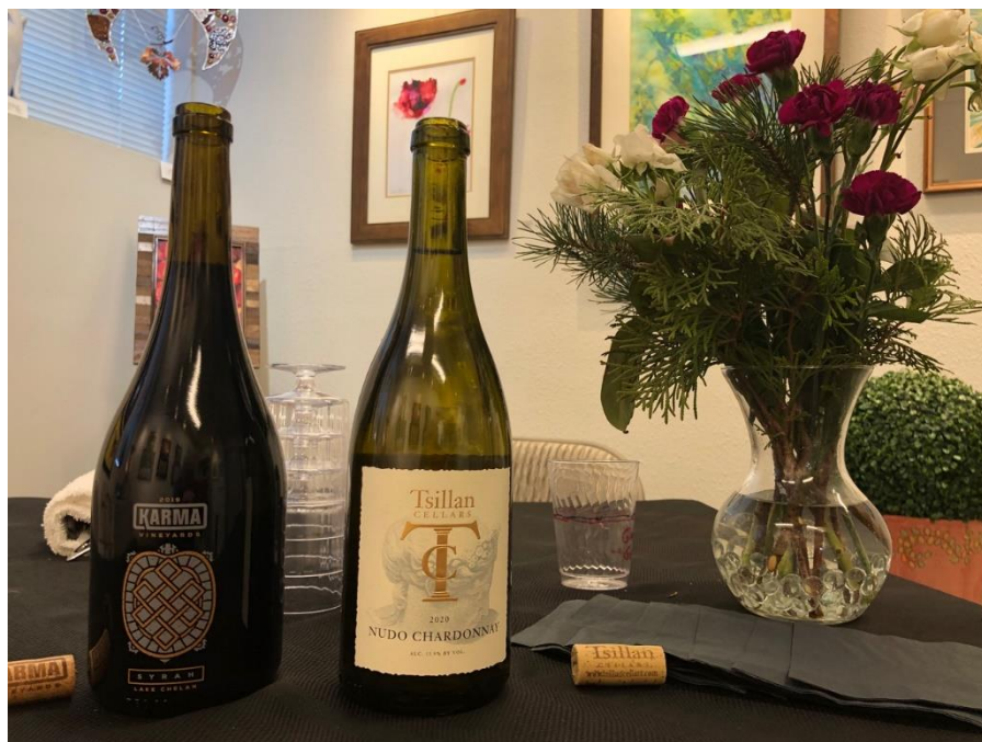
Serving fine local wines tonight.