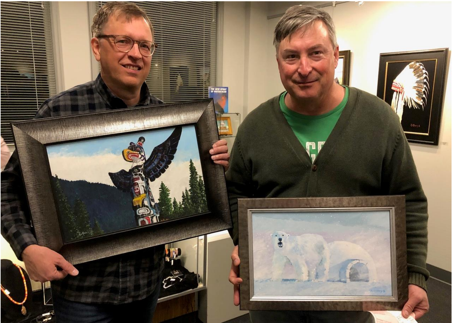
Skiing at Mission Ridge today and dropping into Two Rivers Gallery was a good idea for two skiers from Minnesota. They each chose a Rainey painting to take back home. Their choices will barely fit in their onboard bags.