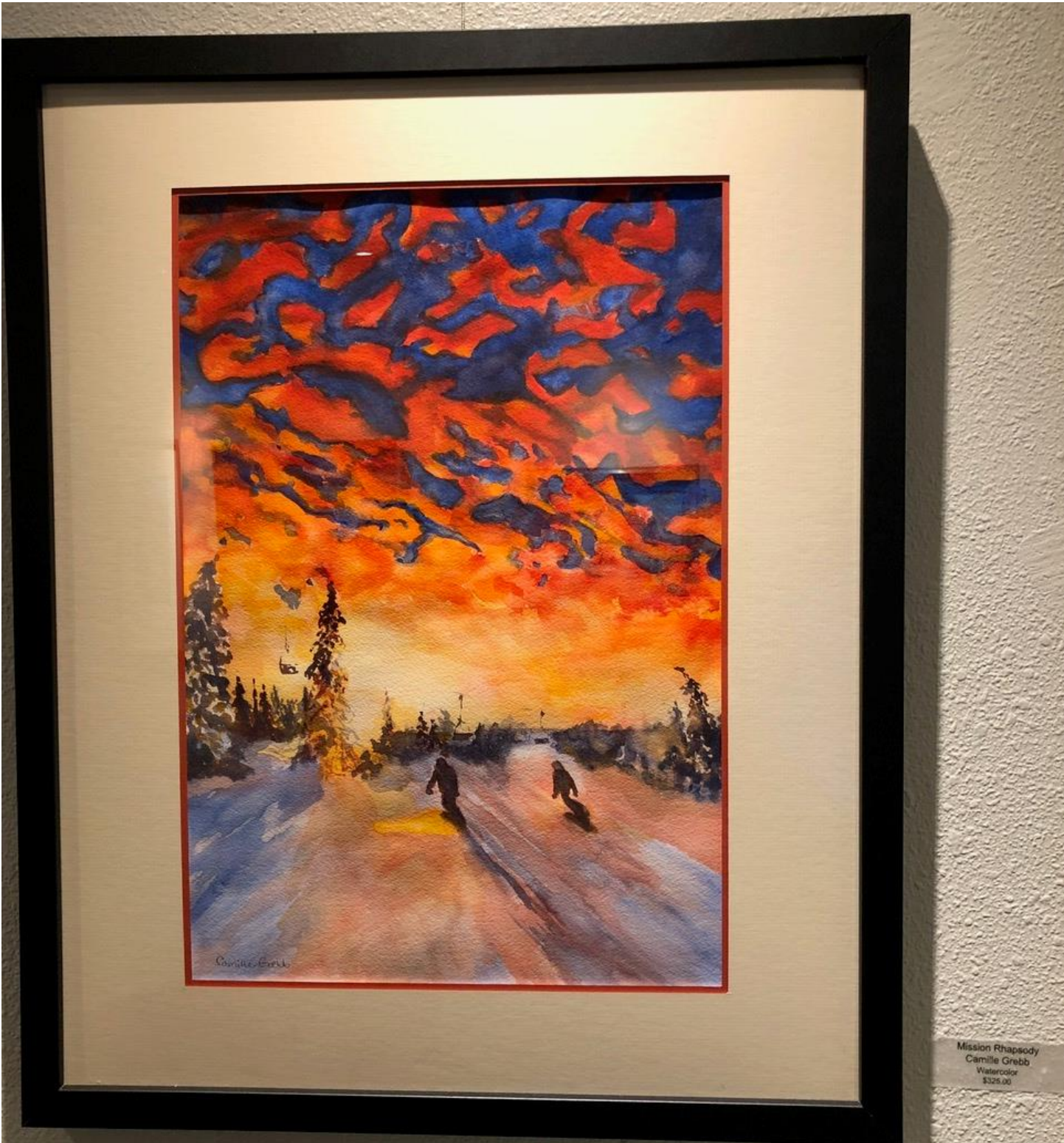
It is nearing the end of ski season and Camille Grebb's watercolor captures the last run.