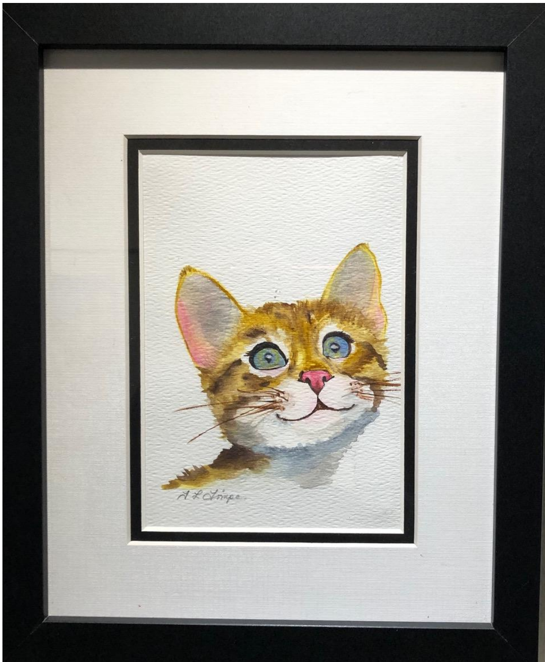
Can a cat make you smile? Terri Timpe is coloring her fun cat sketches.