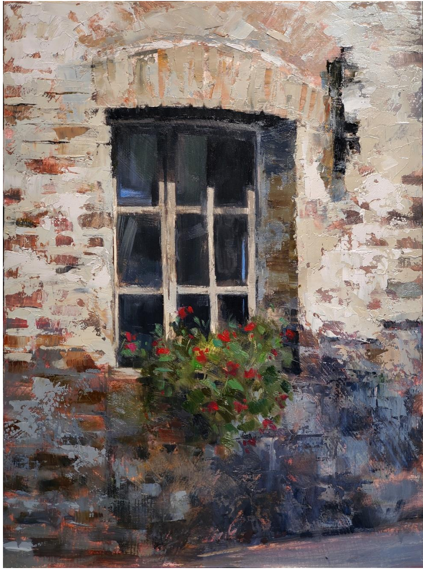
"Window Box, Italy" by Jen Evenhus. Jen visited Italy a number of years ago and loved this building and the window box! Stop by today to relive your memories of Italy and maybe add it to your collection!