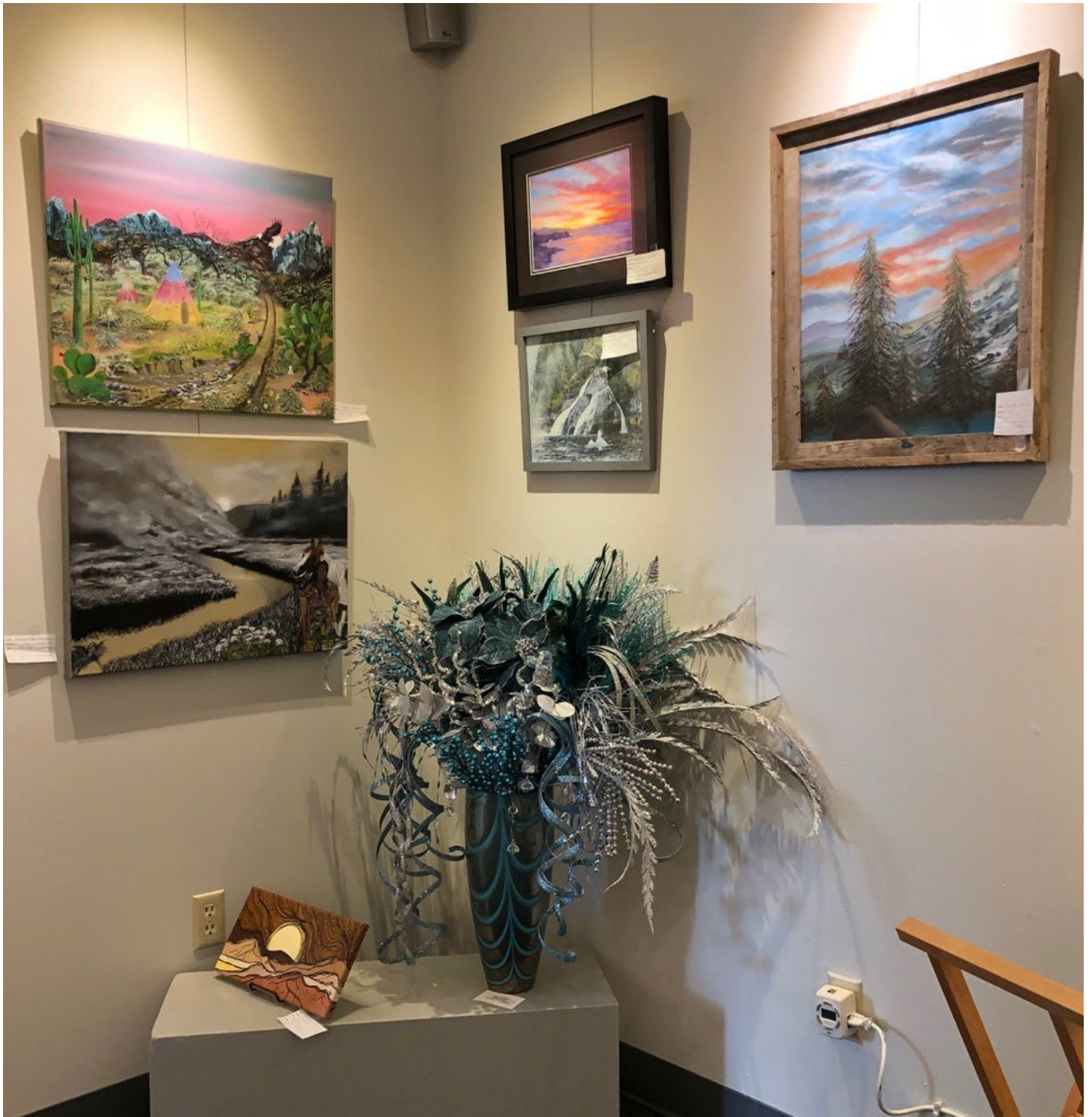
The gallery opens with a new show of 52 artists showing their artistry.