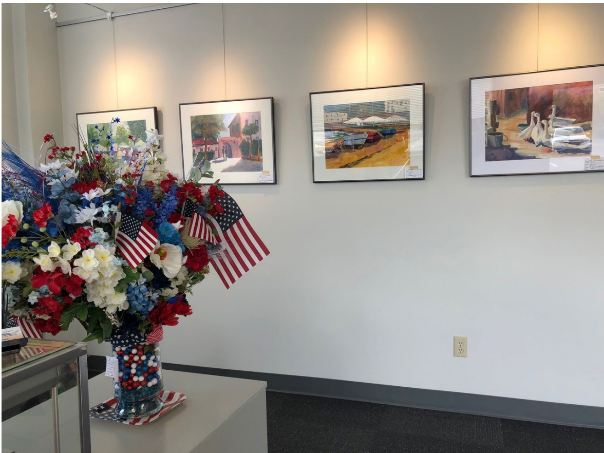
Some scenes are of the Northwest and others are from travels to Europe.