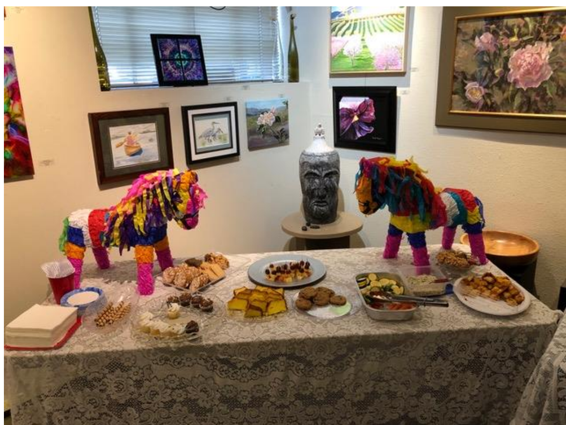
One of our food tables was set, reminding us of Cinco de Mayo which is celebrated on Sunday.