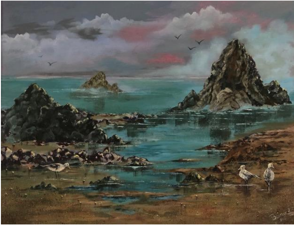
Congrats to Barbara as this painting was shown in the 'GO' magazine this week.