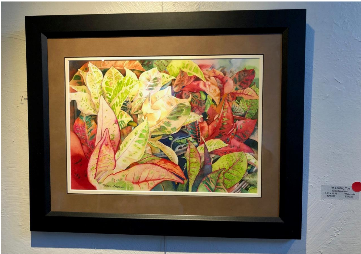
SOLD: "I'm Leafing You"