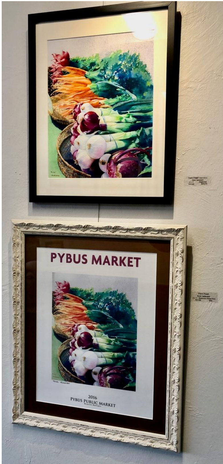
On Exhibit by Nicki is the original painting and print of the winning 2016 Pybus Market poster contest.