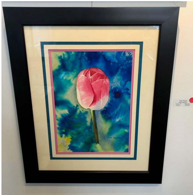
SOLD: Tulip Tango was sold to an art collector.