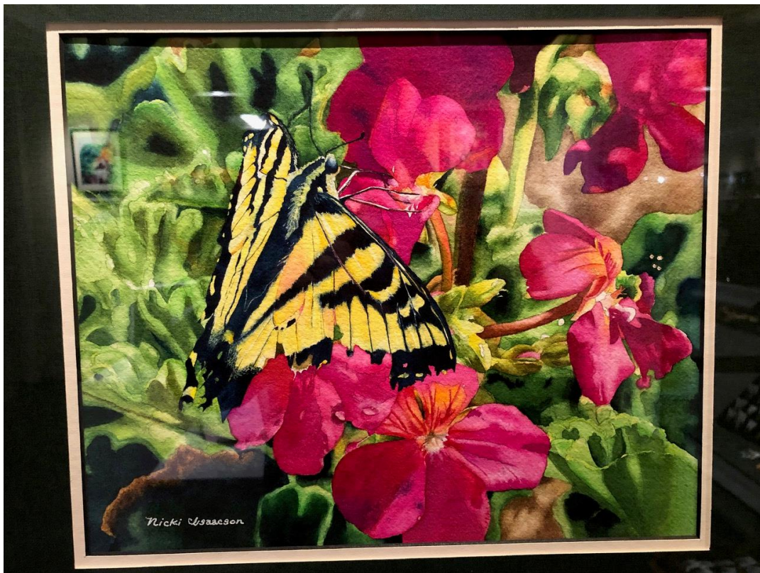
SOLD: "Butterfly Flutter-Bye"