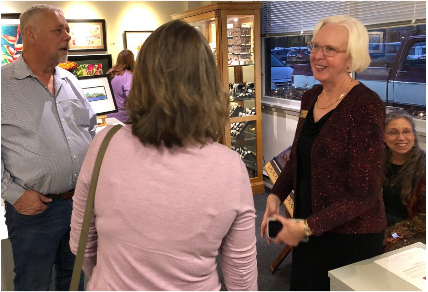
Many friends of art dropped in to support the show.