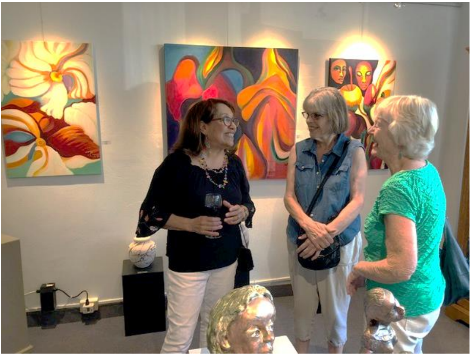
Sold... "White Angel" top right.