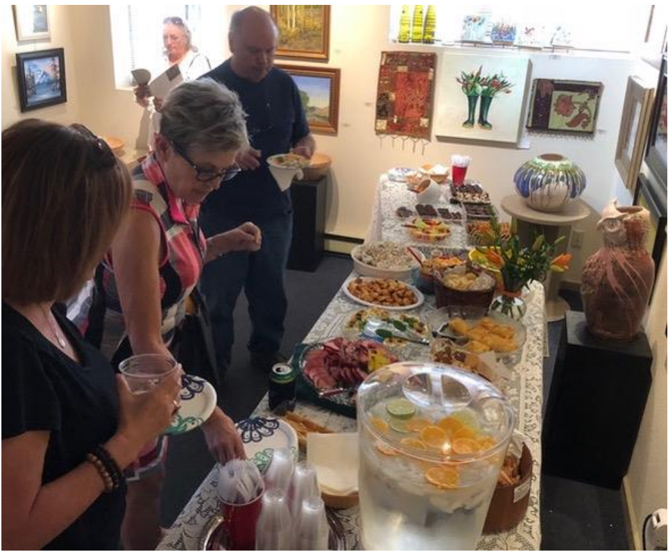
Best hors d'oeuvres in town can be found each First Friday event at Two Rivers Gallery.