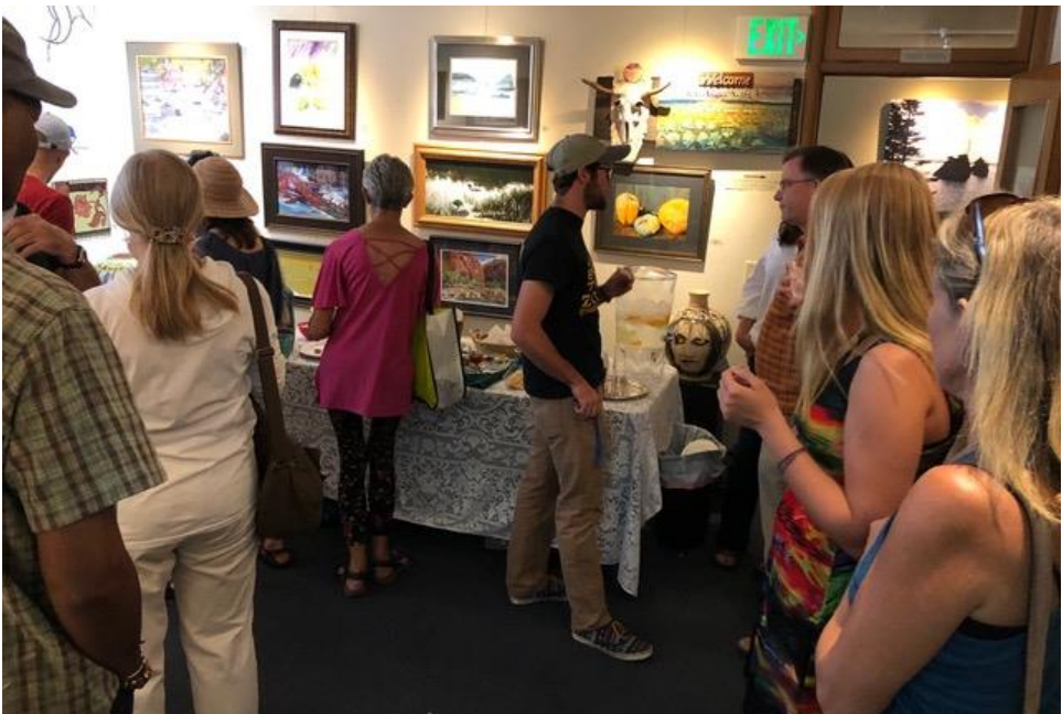
Our rooms were filled to capacity much of the evening.