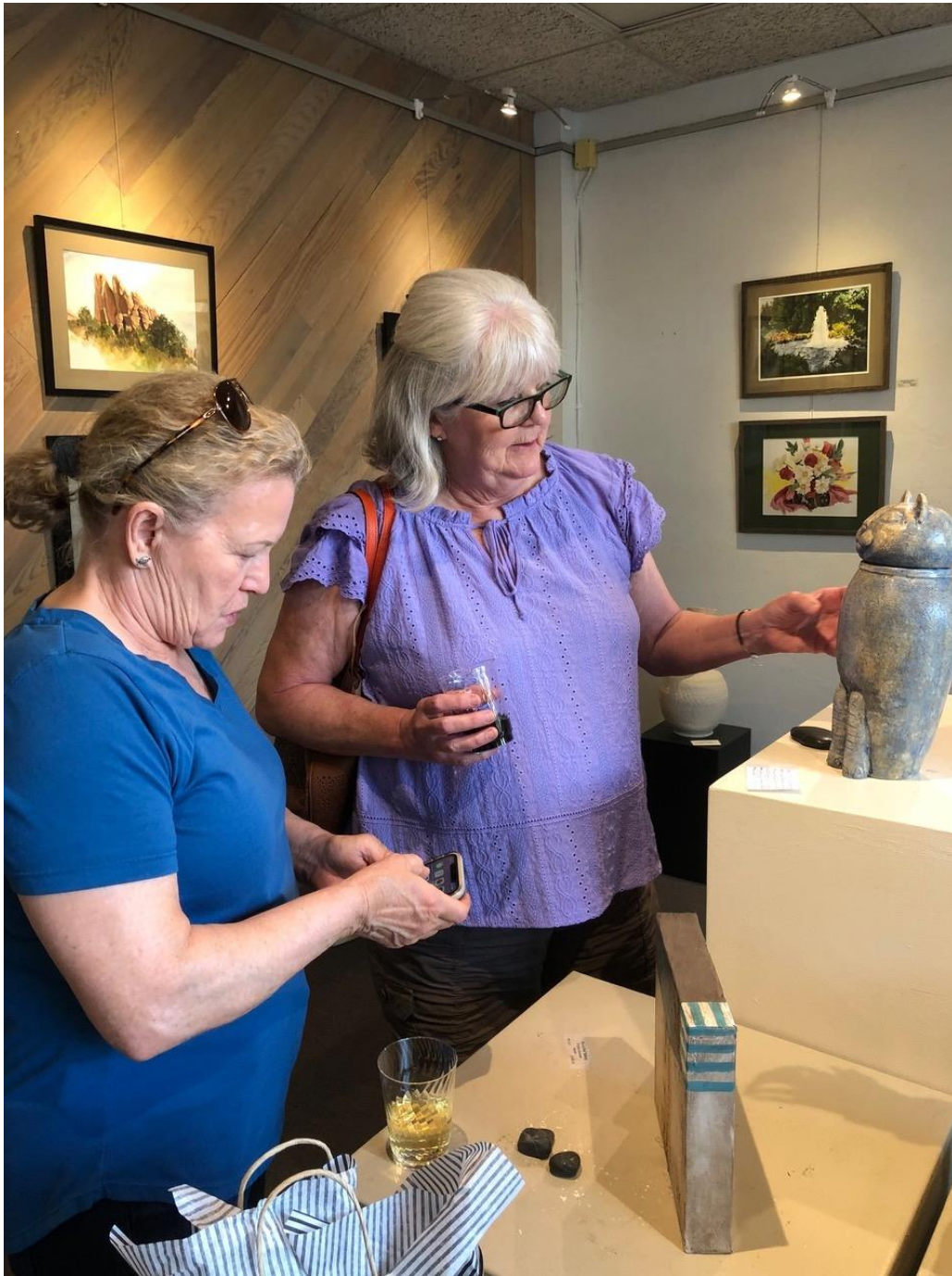
Two ladies admiring one of Warren Bissonnette's blue cats.