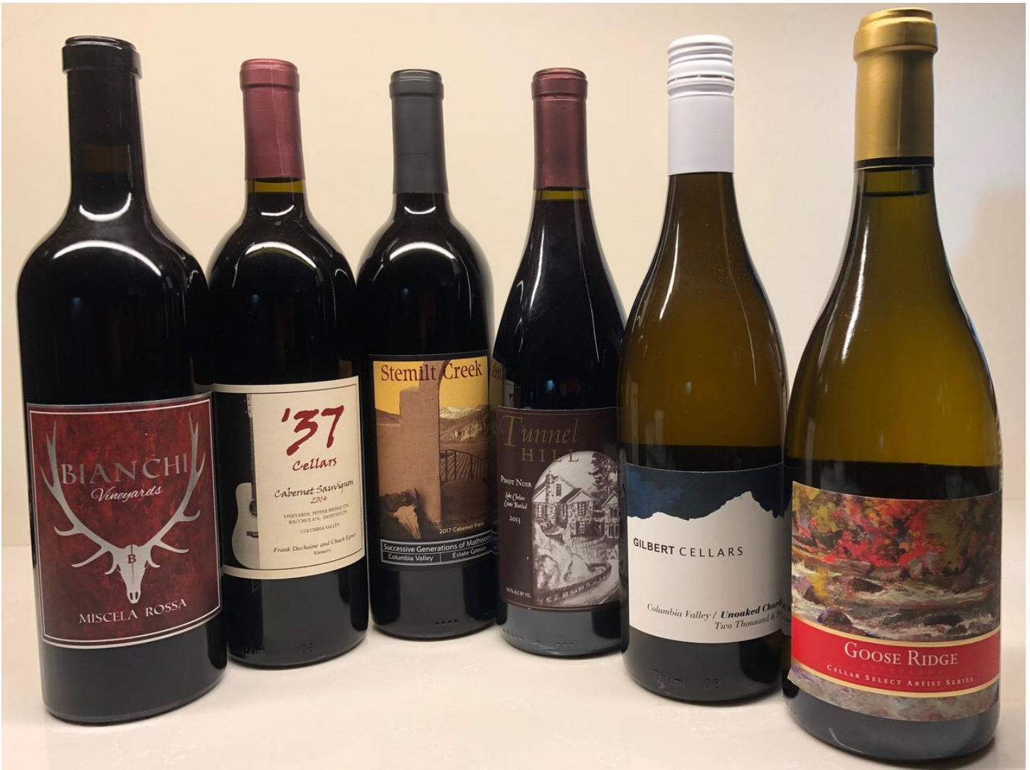
Wine tonight was offered by these fine wineries.