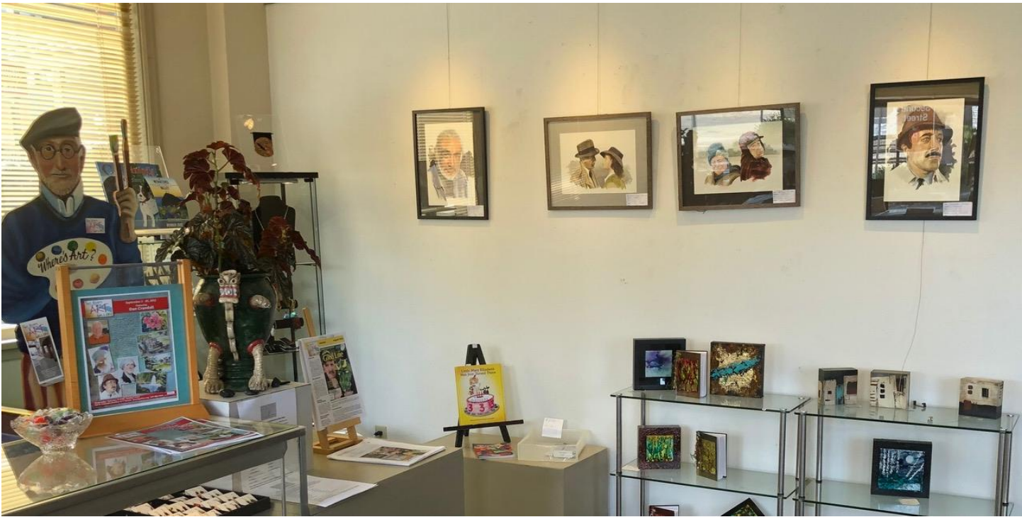
Some of Crandall's presentation included movie stars and well-known people.