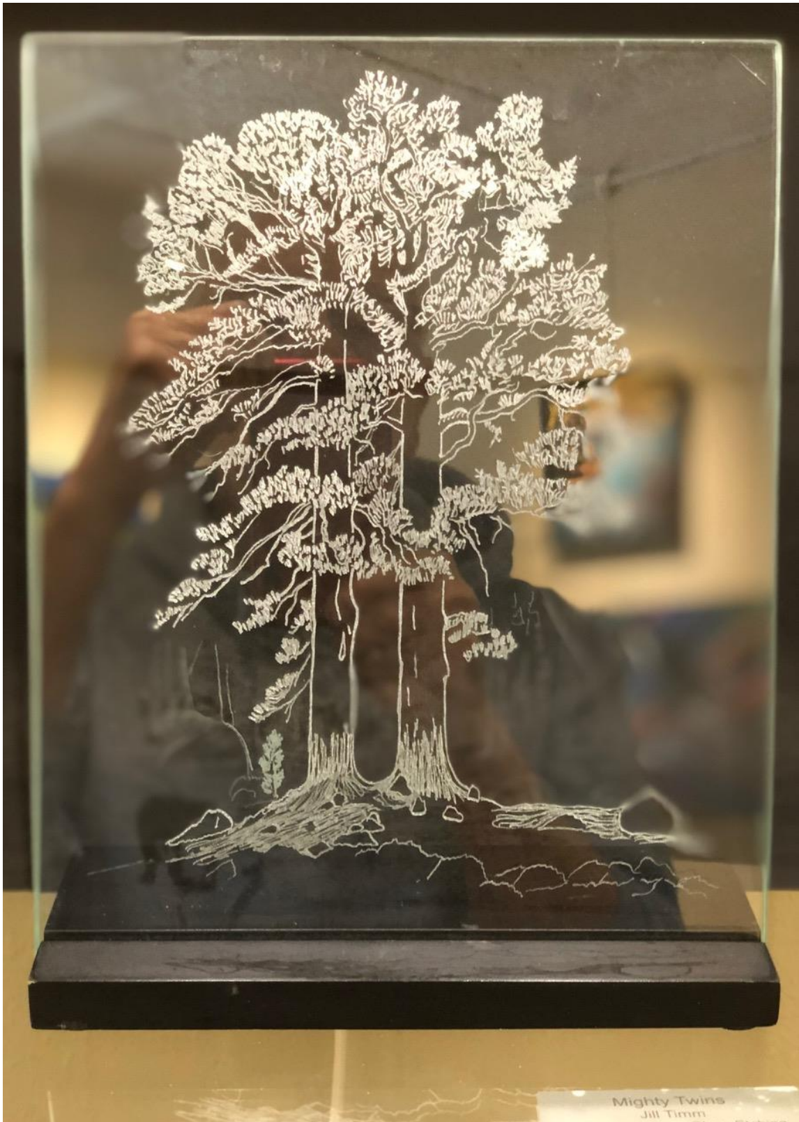
Showing for the first time is a glass etching by Jill Timm.