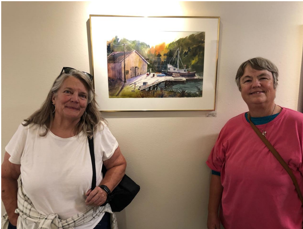
Two visitors from Ashland OR said they were watercolorists and wanted to see the show. They also said Wenatchee is a beautiful place and should advertise more. We told them they should discover the Pybus Market before they leave.