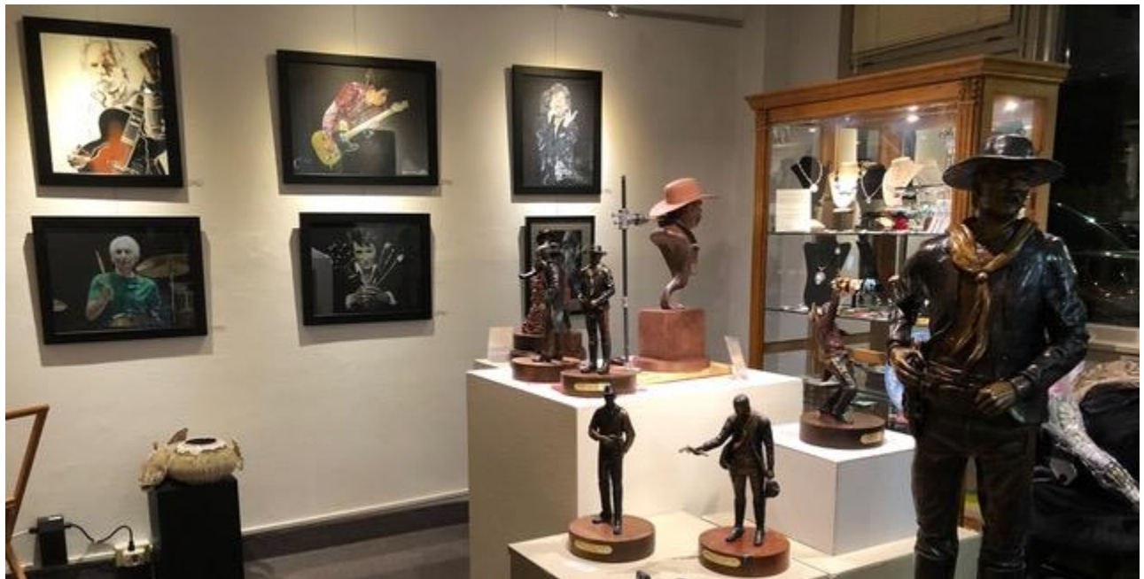
It's not often we crowd into one room with famous characters in music, sports and the movies.