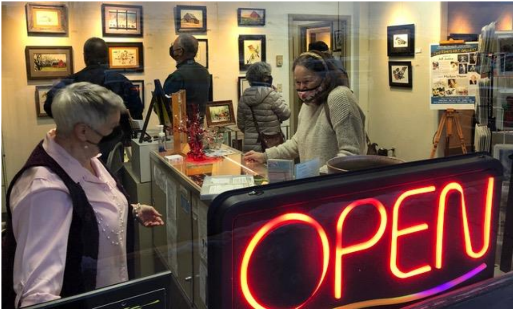
Our opening includes the artworks of 58 local and regional artists of all skill levels.

This was the most well attended First Friday since the pandemic started. The gallery looked like a return of the crowds we have had for many years. Thanks to the promotional help of the Downtown Association and the Wenatchee Chamber of Commerce.