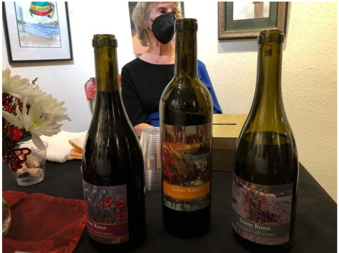
Tonight's wines were provided by Goose Ridge Winery . Labels were designed by Jen Evenhus.