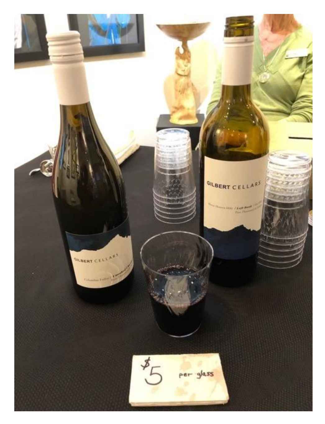
Thanks to Northwest Public Radio (one of our corporate sponsors) for offering fine wines by Gilbert Cellars. Jones of Washington has just contacted us to offer wines for our future First Friday event. We hope to provide only local wines and appreciate the generosity of the best wines Washington has to offer.