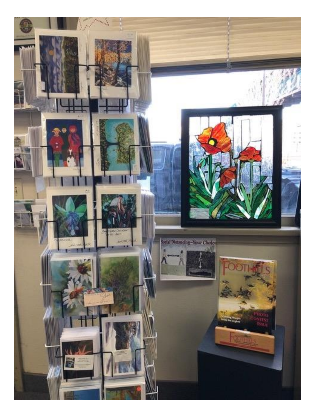
Some of the finest art can be found in the card rack. It contains many of our artist's finest works.