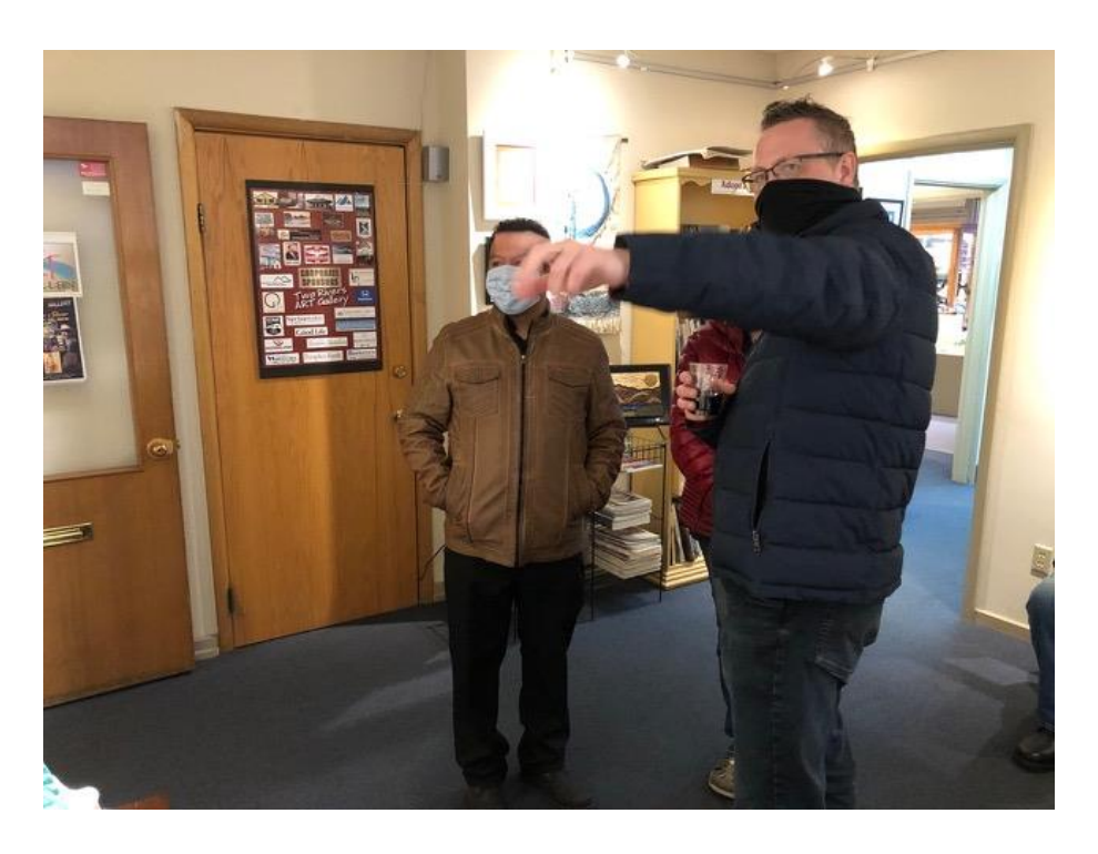
This gentleman finds that a glass of wine can help with choosing a painting, or at least critiquing one.