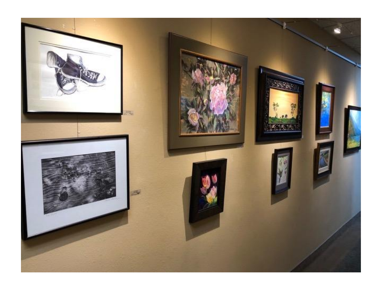
One of the most popular places to view art is in the West Wing of the gallery. Two Rivers is open 5 days a week, however, the West wing is open for viewing 7 days each week.