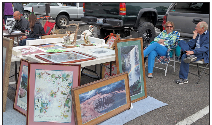
The Tailgate Art Sale welcomed the community to sell their own art.

Tired of that painting or piece of art that has been on your wall and no longer fits your decor? Sell it at the gallery's Tailgate Art Sale in September. Sell your art from your car or tent in the parking lot at 1st & Columbia. The sale lasts all day. The community is invited to get a great bargain on art. At the 2014 & 2015 sale over $1,000 worth of art was sold. The event is growing and may be held again in 2020.