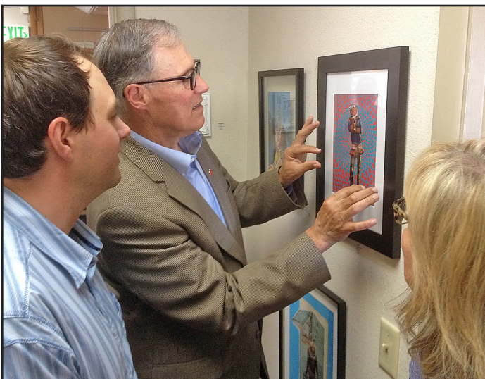
Governor Jay Inslee makes a purchase at one of our First Friday receptions.