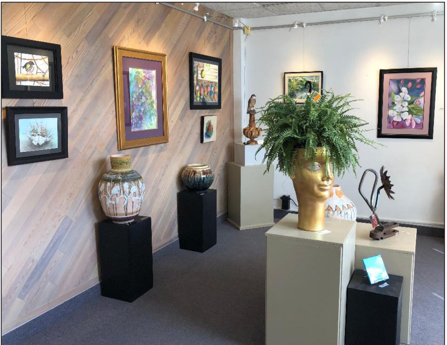
The Wenatchee Watercolor Society has a group membership at Two Rivers Gallery. Their annual show will run through July.

Their membership is open to all who enjoy the pleasure and magic created by watercolor paint on paper.