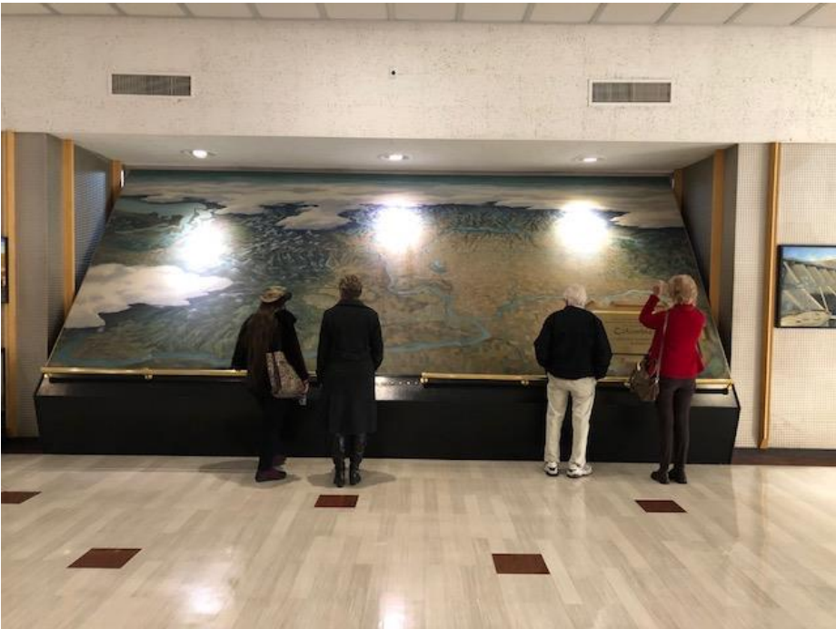
The Washington map that lights up Columbia River dams will be placed downstairs near the new entrance for those taking hard hat tours of the powerhouse. Russ pushed the buttons to light up Wenatchee.