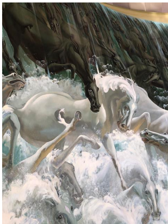
"Horsepower" has been at the dam's visitor center for 57 years. Perhaps it will find a new home where the public can enjoy Wenatchee's most beloved work of art.