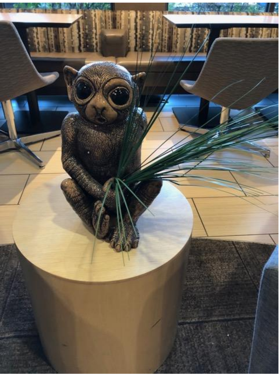
SOLD! The monkey captivated Ronnie.