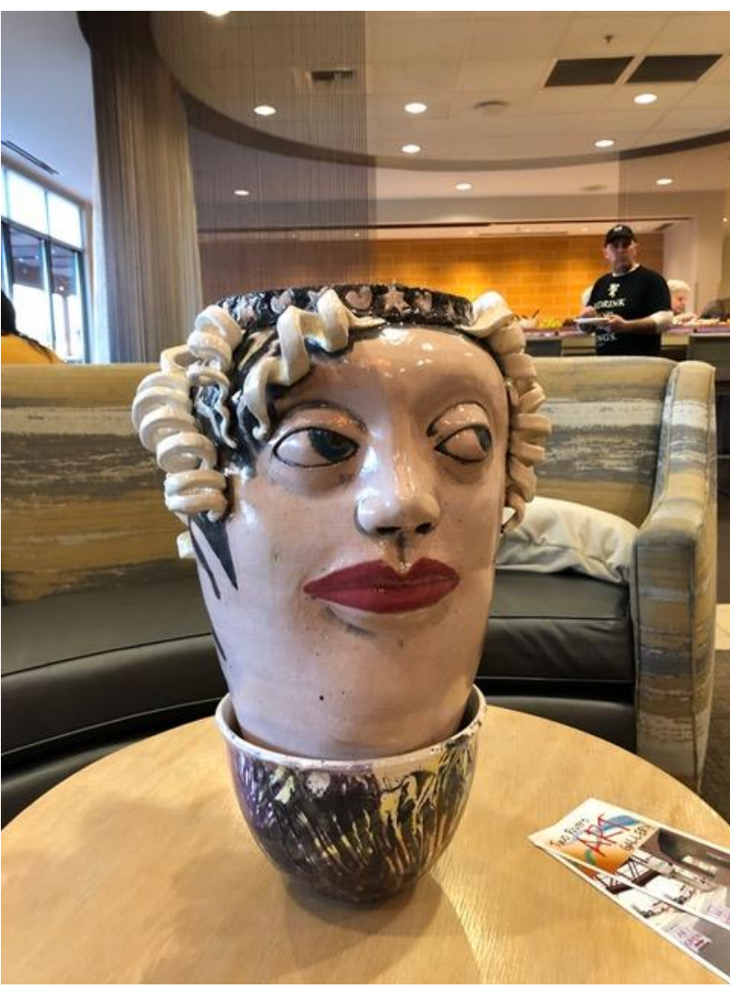
...the lady waits...