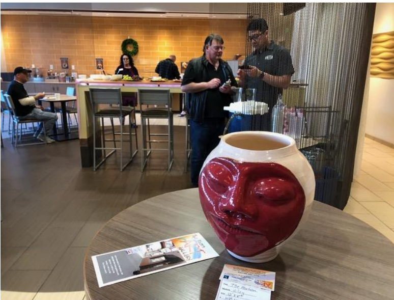
....does this pot sense pleasure?...behind the beaded curtain are the brew makers of Saddle Rock Brewery. They provided samples of their locally crafted 'blonde ale' fully hopped beer.