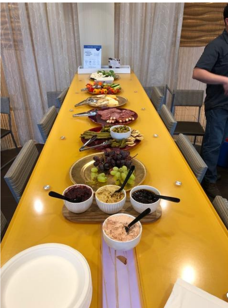
Vegetables, fruits, meats, cheese & condiments