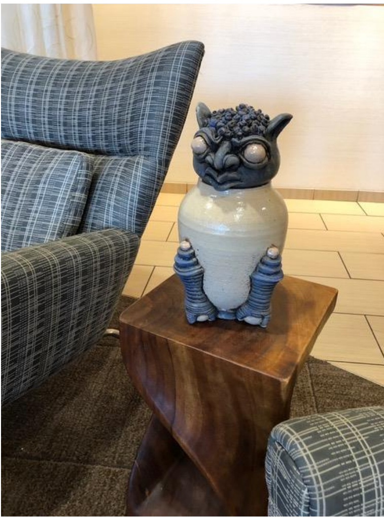
...yes, pottery is sculpture...amazing!