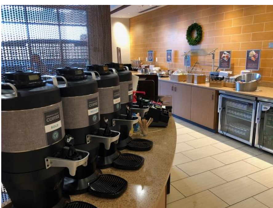
Hot drinks, meat balls and spaghetti with green salad.