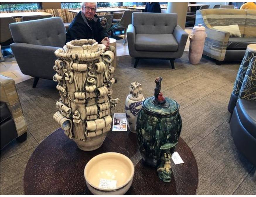
....a pot for every taste...